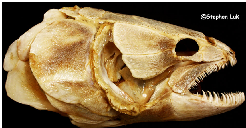
Formidable Fang-like Teeth of the Bowfin

One more remarkable adaptation completes the unique mudfish package – accounting for the name “Bowfin.” Maneuvering in close quarters and in heavy vegetation can be a problem, especially for a large fish. But nature has provided the mudfish with an elegant solution. By undulating its long dor-