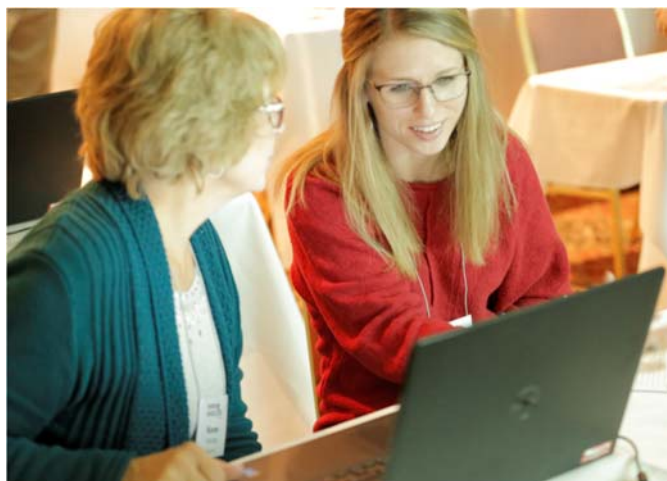
Participants work together on to build a farm in Quicken, a personal financial software, during a 2018 workshop

and three of the workshop sessions on the Nebraska Women in Agriculture Facebook Page. As of March 23, 2,175 unique viewers, 91% of which were female, have viewed these videos. Facebook users reacted to these videos 162 times, commented 17 times and shared 24 times. Additionally, a pre-recorded workshop session was also posted on Facebook, it received five likes and two shares. Following the conference, these video recordings were placed online at http://wia.unl.edu and were viewed an additional 67 times.