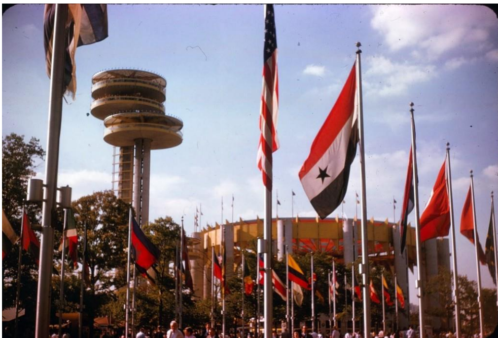
New York State Exhibit

My grandfather took his job as family photographer seriously, and over the course of four decades he produced several huge boxes of slides that my mother has recently begun scanning and digitizing. Mixed in with the usual snapshots of weddings, birthday parties, and holiday gatherings are photos he took during a family trip to the 1964/’65 World’s Fair in New York.