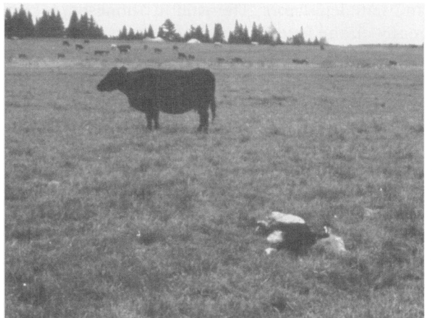
This study attempted to find animal husbandry or habitat factors that distinguished farms suffering chronic depredations to wolves from those that did not. The calf in foreground was killed by a wolf.

We sought to assess the role of suspected major factors that may predispose cattle to wolf depredations and to attempt to elucidate any unknown factors. We did not intend to examine such basic husbandry practices as maintaining herds in good health and nutrition and taking reasonable care of them.