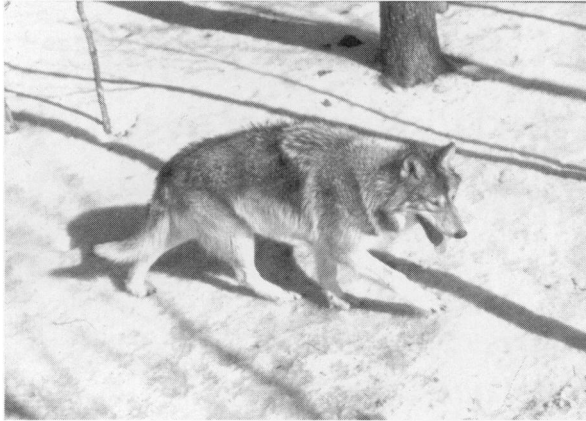
The wolf has reached federal recovery levels in Minnesota, Wisconsin, and Michigan.