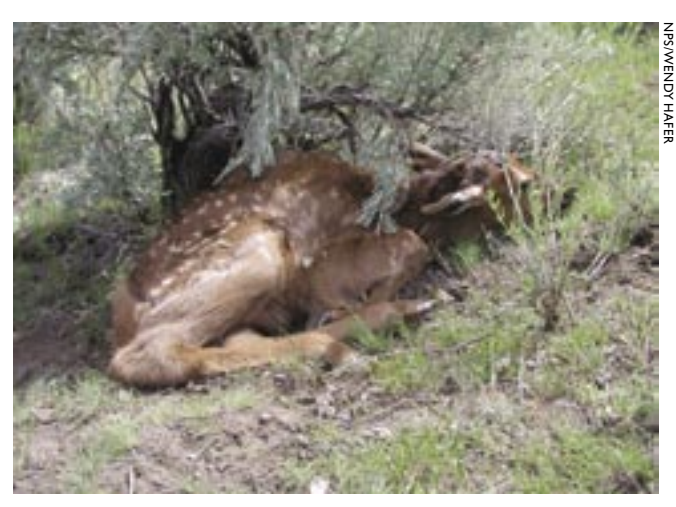
Elk calves that have not yet joined a nursery herd with other calves and cows will often hide under sage brush or near downed timber.