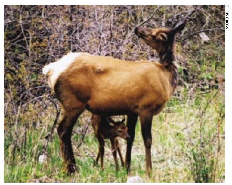
A vulnerable newborn elk calf is dependent on its mother for food and protection from predators.