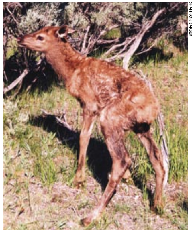
A radio-tagged elk calf is released in the Swan Lake area following capture. Note the wide wobbly stance, indicating that the calf is less than two days old.

We fit calves with 23-gm ear-tag transmitters designed to emit a radio signal for approximately one year, and to change pulse rate if motionless for more than four hours. This change