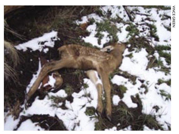
This elk calf likely died of exposure following late spring snow and freezing rain. Fresh bear and wolf tracks were found in the snow less than 10 m from the intact carcass.

Left: Heavy rains the night before likely caused this elk calf to drown in an otherwise shallow creek in northern Lamar Valley. Right: This elk calf was likely killed by a golden eagle near Blacktail Deer Creek. The previous study (1987–1990) also recorded one eagle-killed calf.