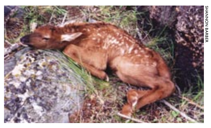
A young elk calf often remains still following capture and processing. At less than four days old, most elk calves tend to hide motionless versus run when they perceive danger.

Each year, we captured a sample of 44–56 calves ≤6 days old, spatially and temporally distributed across Yellowstone's northern range. Spatially, we captured calves from four general areas (Mammoth/Stephens Creek, Swan Lake/Gardners Hole, Blacktail Deer Plateau/Tower, and Lamar Valley) to test for differential survival. Does a calf born in Lamar have a different survival probability than a calf born in Mammoth? Such differences, if found, may result from a variety of factors, including varying predator presence, quantity of preferred vegetation, or weather patterns.