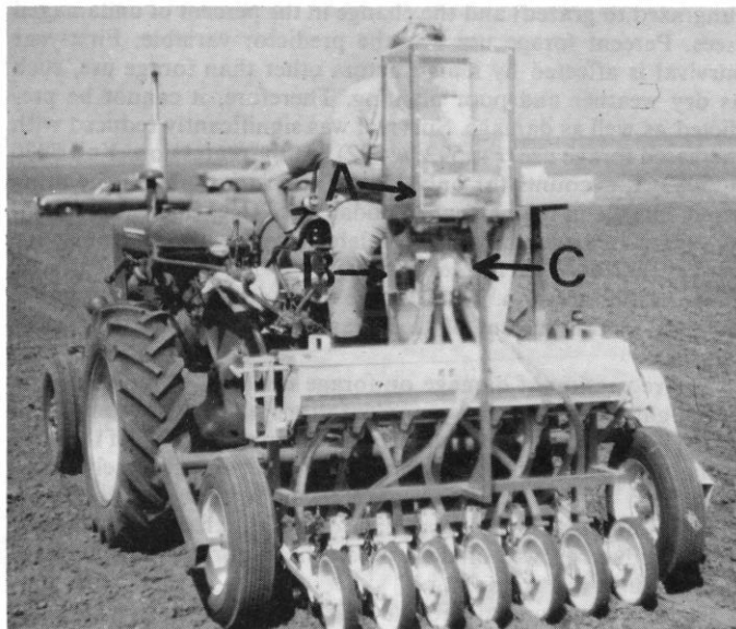
Fig. 2. Rear view of the grass plot drill in operation showing cone (A), electric motor for the spinner (B) and the divider (C).

A K. E. M. Corp. 1 plot grain drill was modified into a cone seeder with a spinner divider by K. E. M. Corp. according to my specifications. The same procedure could be used to convert rangeland drills to plot seeders using commercially available cones and distributors. A K. E. M. cone seeder and spinner divider unit was mounted over the seed box of the planter (Figs. 1 and 2). The cone is driven by one of the planter wheels using a gear drive assembly. The gear drive is directed through a Zero-Max 1 unit, which makes it possible to vary plot length from 1.2 to 15.2 m by