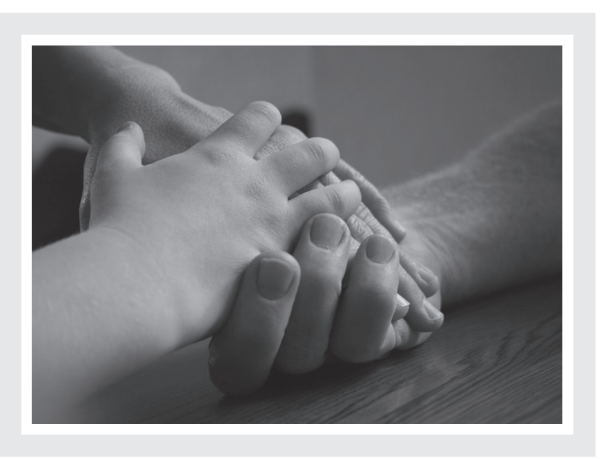
FIGURE 2. THE IMAGE FROM JOSHUA'S DIPTYCH

The images and reflections led to a recognition of the intersections of privilege and exclusion within our own classroom, breaking down what Yavneh