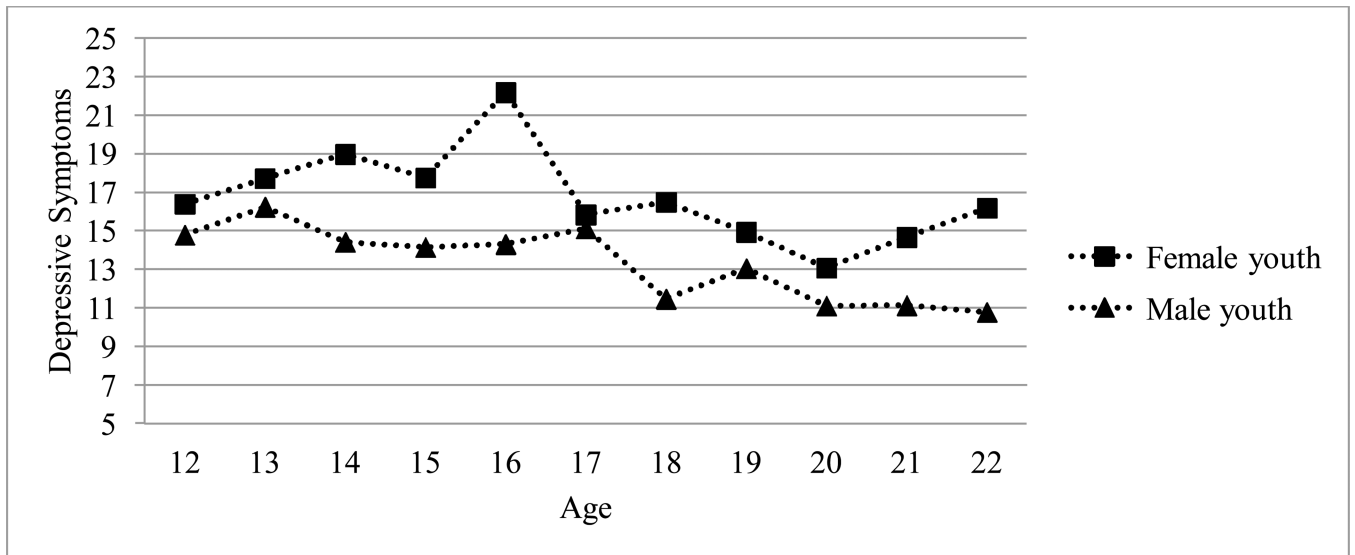
Figure 1. Observed depressive symptoms means from age 12 to 22 years old. Note that observed means were graphed based on discrete age; individuals ranging from 12 – 12.99 were considered 12 years old, 13 – 13.99 were considered 13 years old, etc.