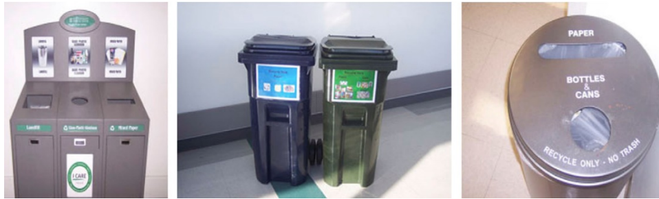
Figure 1. Three bin types used at Rush University Medical Center, bin type 1, bin type 2, and bin type 3, respectively.

and hospital buildings. Bin type 2 was a set of individual, colored bins made by Rubbermaid. A green bin with a specialized lid with a circular hole for disposal of bottles and cans was used for commingled items and a blue bin with a specialized lid with a narrow slit for disposal of paper items. The presence of a trash bin next to bin type 2 varied by location. Bin type 2 was found in public areas in the academic buildings. Bin type 3 was a round, gray bin specifically for recyclable materials with slots for commingled and paper that fed into one liner made by Glaro (see Fig. 1). Bin type 3 was found by elevators in the hospital and physician office buildings. Trash bins were not located next to bin type 3. Five bins from each bin type were chosen for sampling from various buildings across campus for geographical diversity.