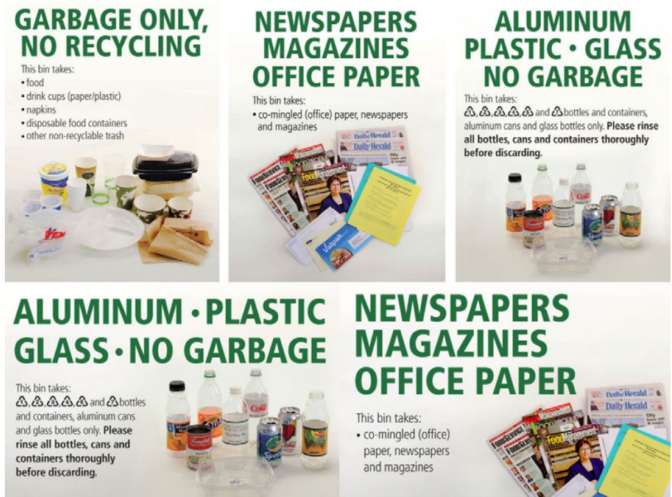
Figure 2. New signage for bin type 1 (top) and bin type 2 (below) for phase 2 of data collection.

The Green Team, a sustainability group at Rush, developed new signage for the recycling bin types 1 and 2. New signage was not developed for bin type 3 because of limited space on bin lids and restrictions for placement on walls in patient units. The signs were developed to help the patrons at Rush better understand what should be placed in each bin. The new signage had pictures of items specific to Rush that could be placed in each bin as well as new titles for descriptions of the bin (see Fig. 2). All signs were changed within 48 h in March 2011. Signs for bin type 2 were placed on the lid (rather than the front used previously) for more accessible viewing; signs for bin type 1 replaced the previous signage. Approximately 8 weeks after the new signage was implemented, data were collected again for 2 weeks on 5 consecutive days, Monday through Friday, in the same manner as the first phase for only bin types 1 and 2. EVS was renotified not to pull the specific bins during the time data were being collected. The commingled bags were collected and weighed in the first week, and with recycled paper were collected and weighed in the second week.