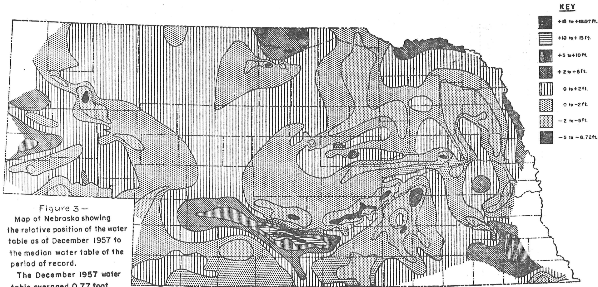
Figure 3— Map of Nebraska showing the relative position of the water table as of December 1957 to the median water table of the period of record.

The December 1957 water table averaged 0.77 foot below the median.