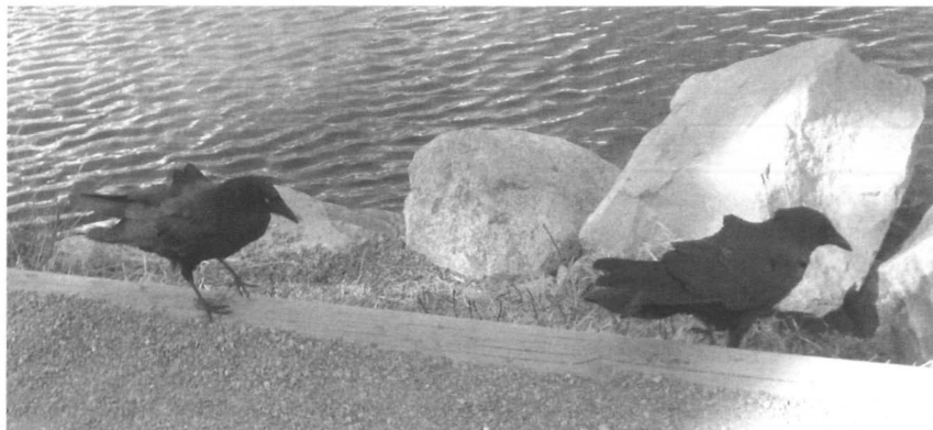
Fig. 2. After a single Common Raven that had been following a fisherman began consuming brook trout eggs released from a female fish handled by the fisherman a second raven arrived and also began foraging on the brook trout eggs.