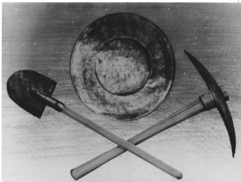
PIC, PAN AND SHOVEL, 1980, color lithograph, 22 1/4 x 30 in.

Sheldon Solo is an ongoing series of one person exhibitions by nationally recognized contemporary artists. As a museum of twentieth century American art, the Sheldon Memorial Art Gallery recognizes its responsibility to present both a historical perspective and the art of our time. Each Sheldon Solo exhibition assesses the work of an artist who is contributing to the spectrum of American art, and provides an important forum for the understanding of contemporary art issues.