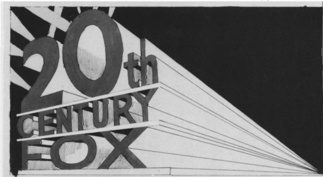
TRADEMARK 2, 1962, ink, pencil and oil on paper 8 5/16 x 14 1/2 in.

In the 1970s, Ruscha began to focus on isolated words on the canvas, rather than invoking words as an integral part of a specific product or symbol. His works of this period are appropriate illustrations of many of the conceptual issues with which artists at the time were grappling. These paintings ►