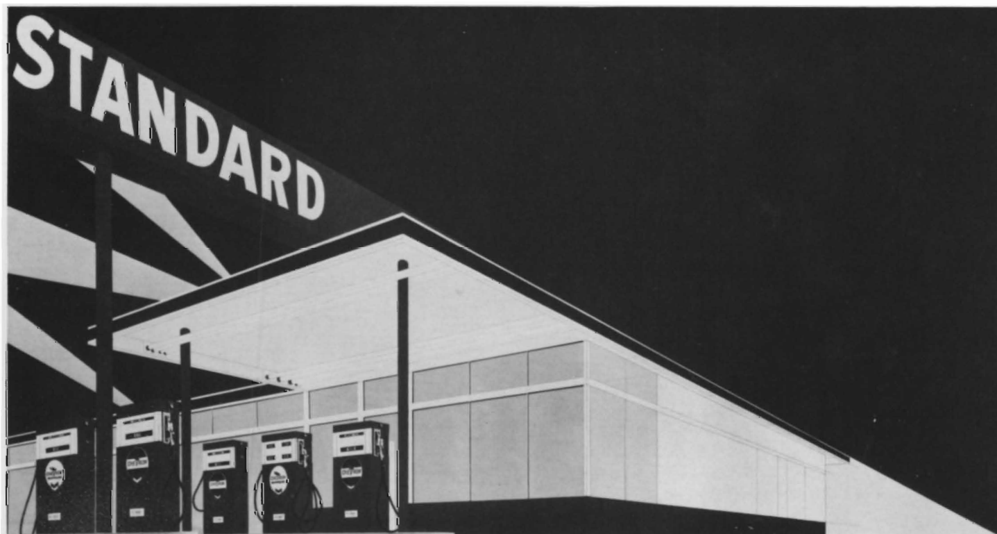
STANDARD STATION, AMARILLO TEXAS, 1963. ( Not in the exhibition.)