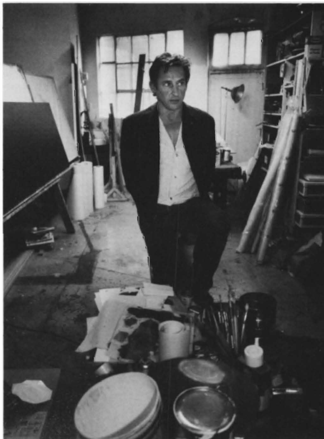
Ed Ruscha in his studio.

HOLLYWOOD , 1968, colored serigraph, 17 5/8 x 44 3/8 in.