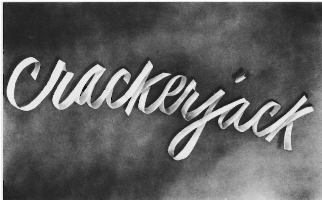
CRACKERJACK, 1967, graphite on paper, 15 x 23 1/2 in.

This physical presence is reiterated in other works, such as a series of paintings done in the late 1960s, in which Ruscha presented the word as if it were written with a