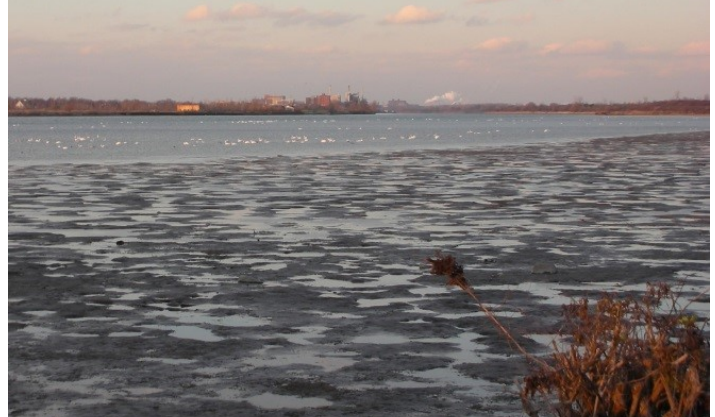
Figure 3. Area completely denuded of submerged aquatic vegetation by mute swans feeding in the area along the Detroit River, Michigan. Area exposed as water level dropped.

Observable mute swan damage includes destruction of submerged and emergent aquatic vegetation. Mute swans typically consume only about 50 percent of the material they uproot or damage during feeding, therefore, remnant vegetation is often floating in areas where mute swans have fed. Although damage to submerged aquatic vegetation may be difficult to assess because it occurs