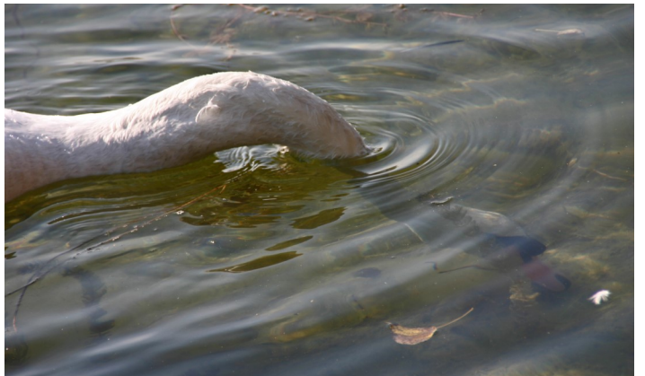
Figure 9. Mute swan feeding on aquatic vegetation and insects.