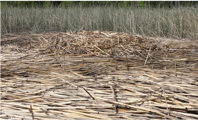
Figure 4. Mute swan nest built of bulrushes surrounded by a large floating mat of ripped-up vegetation.

frightening devices), nonlethal or lethal removal of individual animals, local population reduction, or any combination of these. The course of action depends on the circumstances of the specific damage problem. Consider the biology and behavior of the damaging species and other factors when developing an IPM strategy. The recommended strategy may include any combination of preventive and corrective actions.