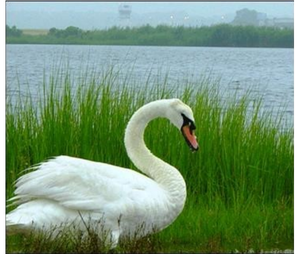
Figure 1. Adult mute swan ( Cygnus olor ).