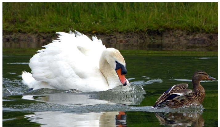
Figure 2. Mute swan showing aggression toward a mallard.

In areas with high numbers of mute swans, attacks on people and pets have become more frequent. Mute swans defend their nests, nesting areas, and young from any