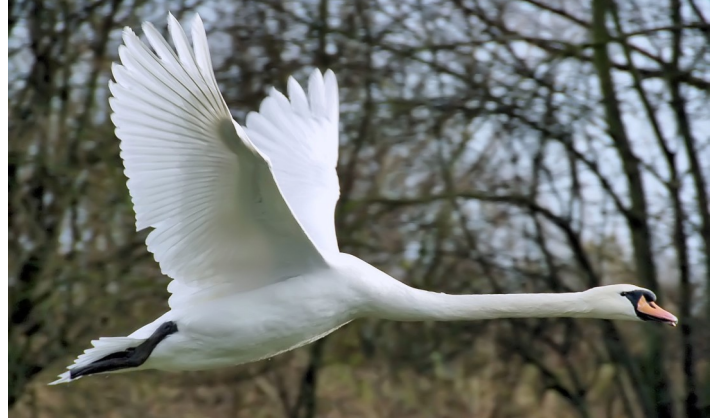
Figure 8. Mute swan in flight.

In areas with human development, mute swans readily habituate to artificial feeding. Begging behavior becomes more prevalent when aquatic vegetation is limited. Artificial feeding has been responsible for maintaining populations in British Columbia and Traverse City, Michigan.