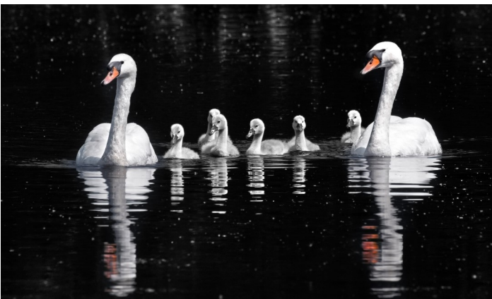
Figure 7. Mute swans with cygnets.

Mute swans usually lay one egg every 2 days until the clutch is complete. The average clutch size varies in different regions, but an overall average is between 5 to 6 eggs. Most males are highly territorial during egg-laying, and some will help with incubation by sitting on the nest to allow the female to feed. Nesting periods vary among regions, but typically begin in March. Hatching occurs in May or June. Cygnets grow very quickly and are able to swim almost immediately after hatching once their down feathers dry (Figure 7). Adults protect cygnets from predators and other waterfowl (including other mute swans), and uproot vegetation for the cygnets to eat. By August, cygnets usually are similar in size to adults and have lost all their downy plumage.