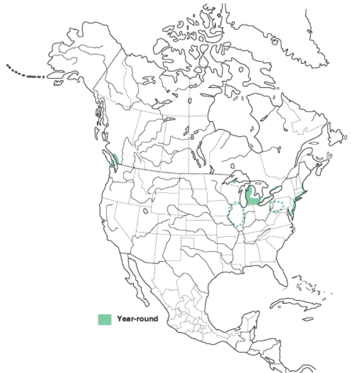
Figure 6. Range of mute swans.