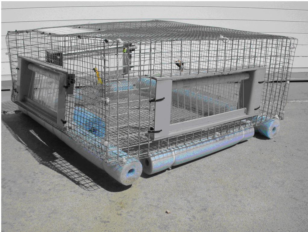
Fig. 1. A multiple capture trap modified to float.

were always placed in locations where bullfrogs had been previously viewed or heard. Adult bullfrogs were sexed by comparing the diameter of the tympanum to the diameter of the eye on each individual (George 1938; Bury and Whelan 1984). All captured bullfrogs were removed from the ponds and euthanized, and any non-target captures were released at the trapping site.