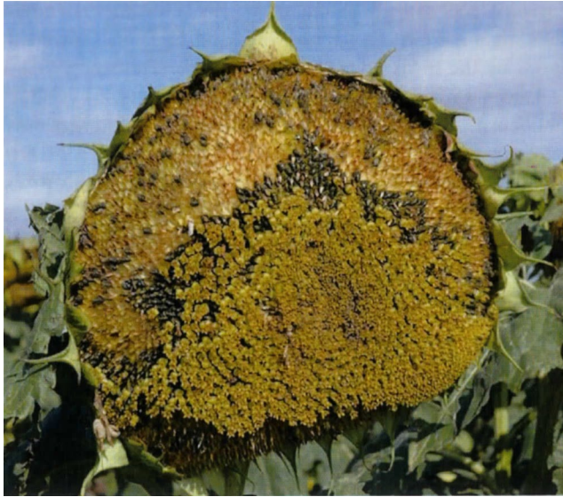
Figure 12.1 Typical damage by red-winged blackbirds to a ripening oilseed sunflower head in North Dakota.

2014; Figure 12.1). Ripening sunflower is particularly vulnerable to blackbirds because the crop is susceptible for 8 weeks, from early seed-set in mid-August until harvest in mid-October (Cummings et al. 1989; Linz et al. 2011).