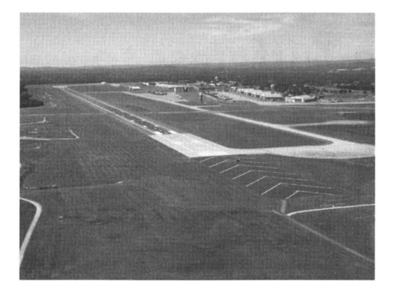
Fig. 10.1. Westover Air Reserve Base, Chicopee, Massachusetts, USA. Airfields often contain large expanses of vegetation, typically composed of turfgrasses and herbaceous vegetation.

ing cover for hazardous wildlife (DeVault et al. 2011), and resist invasion by other plants that provide food and cover for wildlife (Austin-Smith and Lewis 1969, Washburn and Seamans 2004, Linnell et al. 2009; Fig. 10.1).