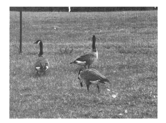
Fig. 10.3. Canada geese in study plot. Research examining the foraging preferences of Canada geese provides information about the selection of plant materials for reseeding projects at airports.

Grazing Anatidae (including various species of geese) apparently make foraging choices based on the nutritional content and chemical composition of plants (Gauthier and Bedard 1991, McKay et al. 2001, Durant et al. 2004). The concentration of protein within forage plants is an important component in the foraging preferences for a variety of goose species, including barnacle geese ( B. leucopsis ; Prins and Ydenberg 1985), dark-bellied brent geese ( B. bernicla bernicla ; McKay et al. 2001), white-fronted geese ( Anser albifrons albi frons ; Owen 1976), graylag geese ( A. anser ; Van Liere et al. 2009), and Canada geese (Sedinger and Raveling 1984, Washburn and Seamans 2012). In addition, sec-