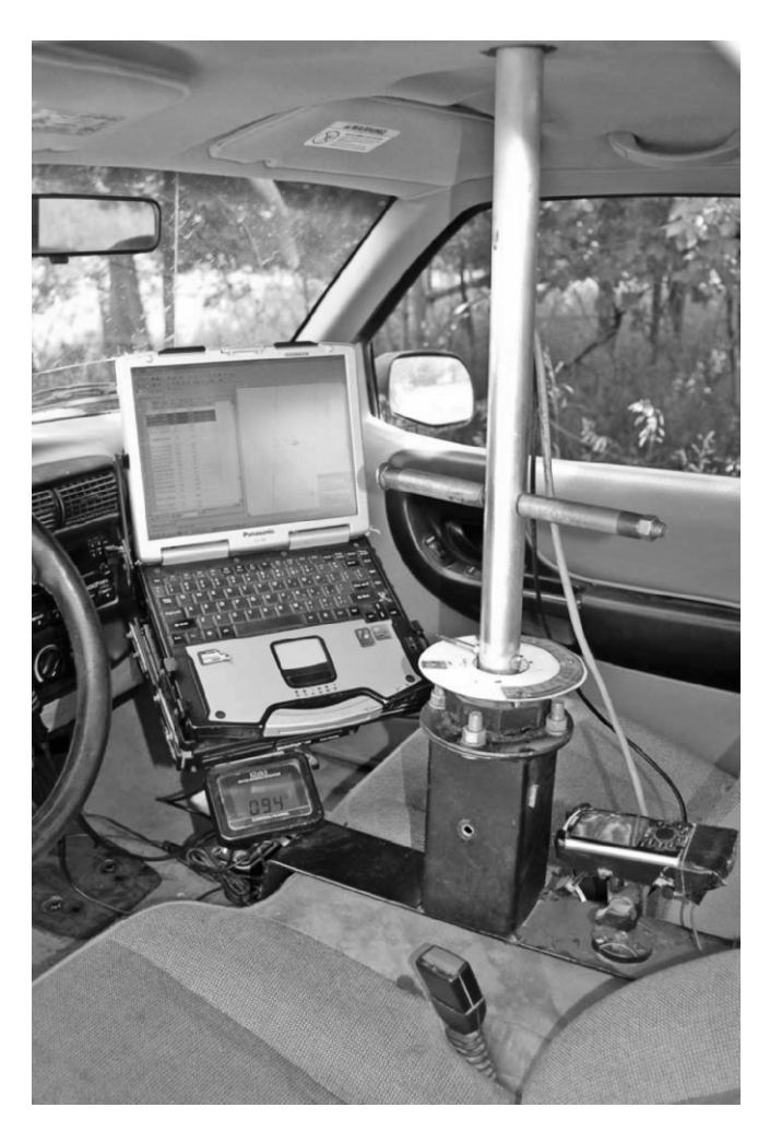
Figure 1. Integrated vehicle-mounted telemetry system showing primary components, tested in Nebraska, USA.

bearing, estimate transmitter location, and to enter data for each transmitter.