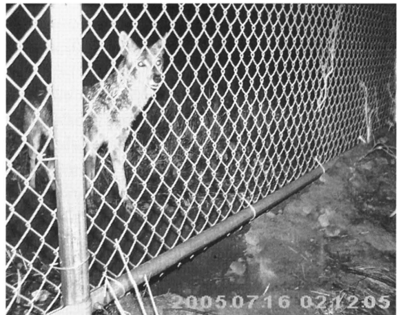
Fig. 5.3. Some mammals, including coyotes, can penetrate fencing without a belowground apron by burrowing. From DeVault et al. (2008)

Openings in fences that appear small enough to impede deer may actually be large enough for motivated deer or other mammals to squeeze through. Adult white-tailed deer were able to pass through a 25.0-cm (10-inch) gap at the bottom of a fence (Falk et al. 1978, Palmer et al. 1985, Feldhamer et al. 1986). Caribou ( Rangifer tarandus ) will also pass through a fence rather than jump, even though they are capable of jumping 2.2 m (7.5 feet; Miller et al. 1972). Coyotes are capable of crawling through 15.2 \times 10.2 cm ( 6 \times 4 inch) openings and can walk through 30.5-cm (12-inch) mesh (Thompson 1978). Ward (1982) reported that a 15.0-cm (6-inch) gap under a fence was enough to allow passage by mule deer, and Feldhamer et al. (1986) documented deer in Pennsylvania, USA, passing through 19.0-cm (7.5-inch) openings. Ultimately, a fence must be of sufficient height, tight to the ground or preferably buried, and lack gaps >15.0 cm 2 (2.3 inches 2 ) to ensure exclusion of deer.