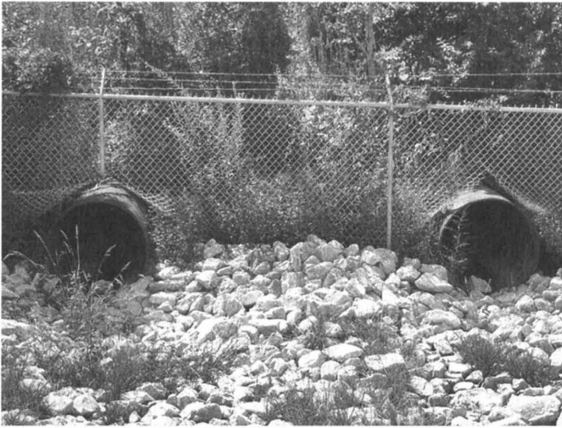
Fig. 5.1. Breaches in airport fencing can allow easy access to the air operations area. From DeVault et al. (2008)

and could be suitable in limited, though unspecified, situations at airports (Castellano 2002). In 2004, an additional CertAlert was released that included all of the above information but specified that gates in fence lines must provide no more than a 15.2-cm (6-inch) gap that could potentially allow access by deer (Castellano 2004). Minimum recommendations provided in the CertAlerts for chain-link fences are appropriate when land managers must virtually eliminate access by medium to large mammals, realizing there is always potential for a break in a fence to occur by uncontrollable causes.