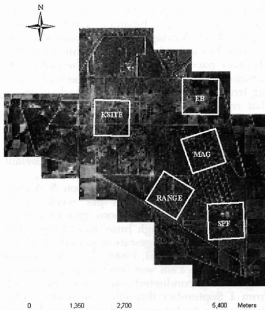
FIGURE 1. Location of five 1-km 2 bait grids on the US National Aeronautics and Space Administration (NASA) Plum Brook Station (PBS) for evaluation of the exposure time relative to raccoon population density of oral rabies vaccination baits placed at 75 baits/km 2 from 20 September through 18 October 2002.

mates of density, despite the fact that animals go undetected during transect surveys (Buckland et al., 1993).