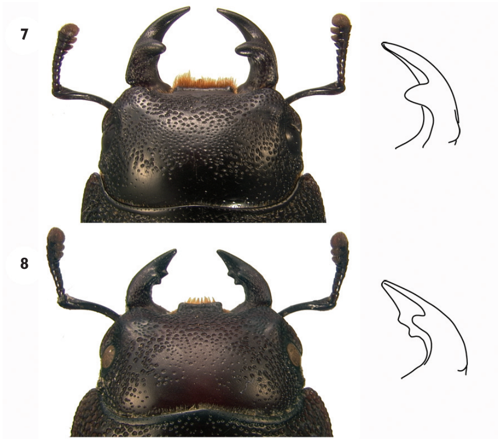
Figures 7–8. Head of minor males, dorsal view. Inset showing dentition of right mandible. 7 Dorcus parallelus 8 Dorcus brevis .

Dorcus carnochani Angell 1916: 70, synonym. Type material: Two syntype males and one syntype female, possibly located in storage at the Brooklyn Museum, not examined.