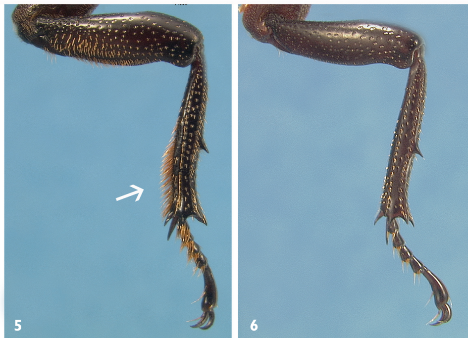
Figures 5–6. Left metatibia of males, ventral view. 5 Dorcus parallelus , arrow pointing to dense field of setae 6 Dorcus brevis .