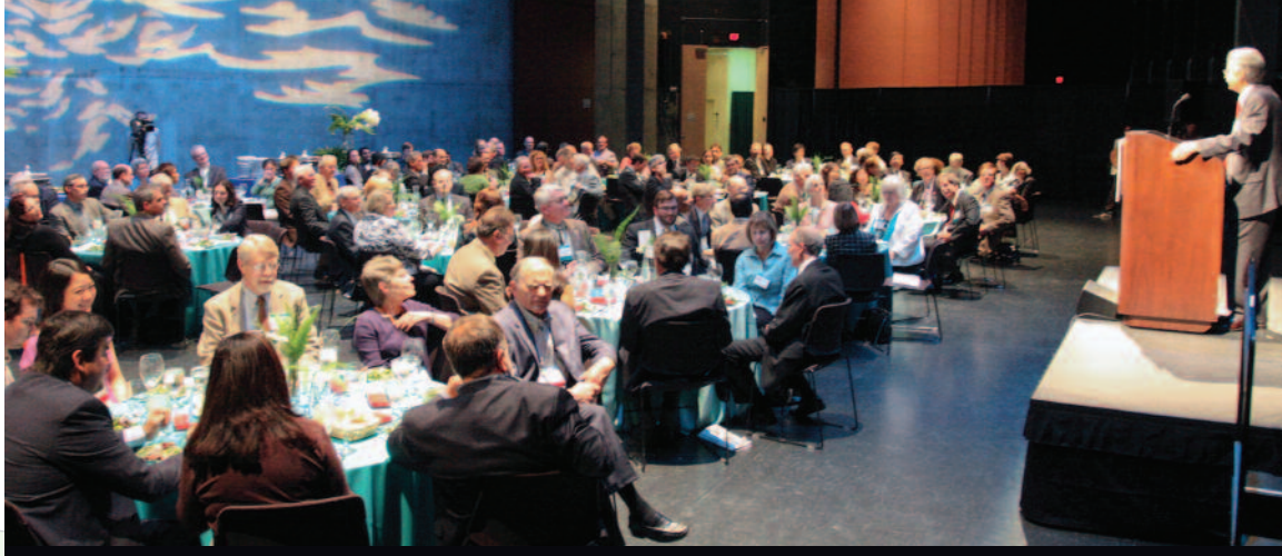
Conference recognition banquet