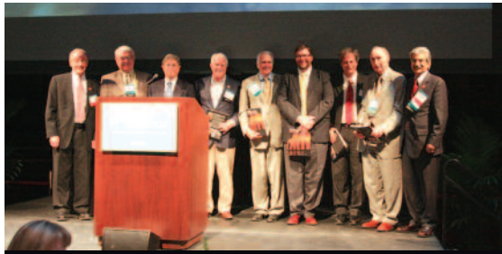
Water for Food Senior Advisory Council