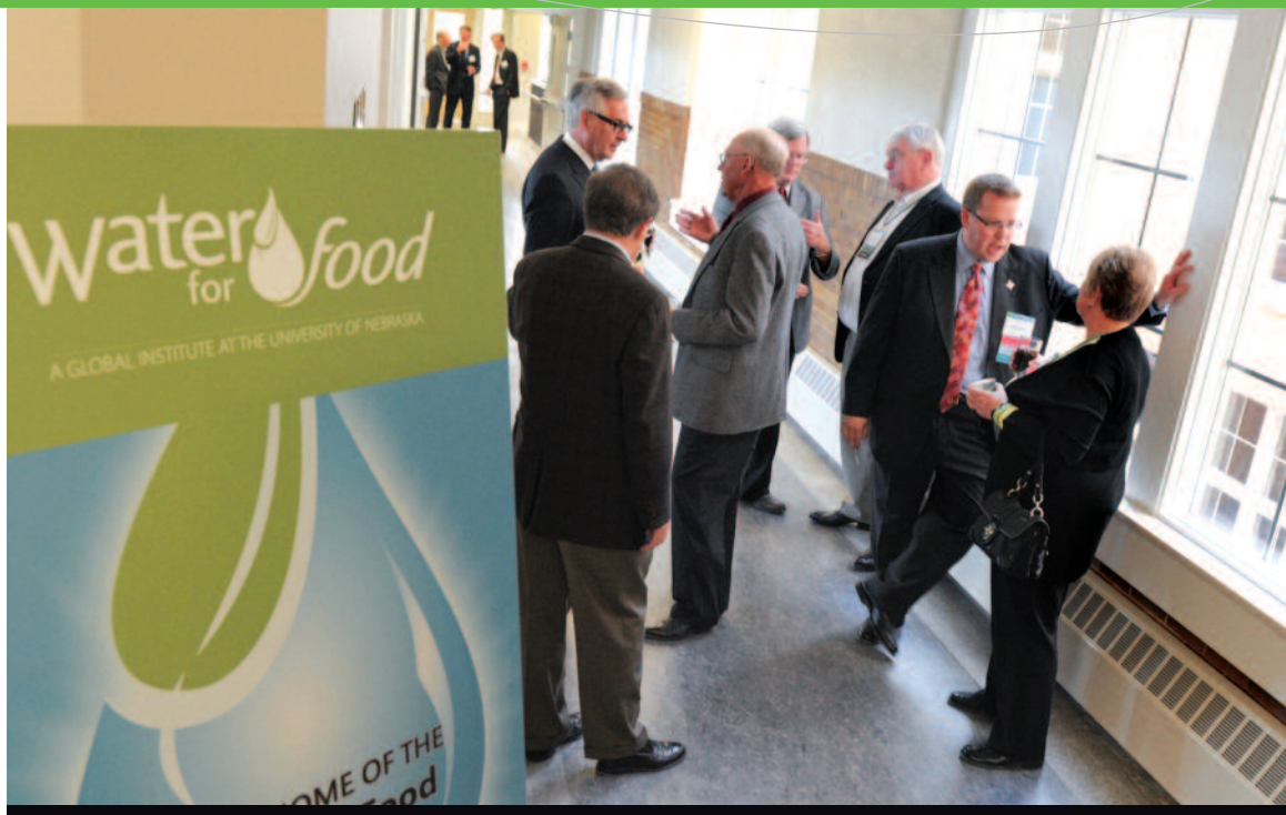
Future home of the Water for Food Institute