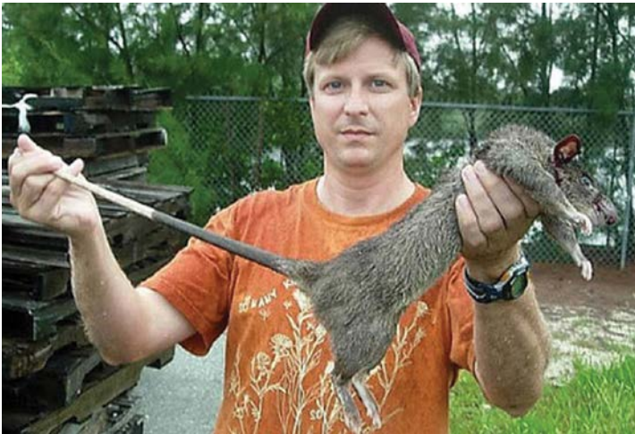
FIGURE 10.5 Gambian giant pouched rat captured in a raccoon-sized cage trap on Grassy Key, Florida.

Gambian giant pouched rats ( Cricetomys gambianus ; Figure 10.5), referred to hereafter as the Gambian rat, are native to a large area of central and southern Africa. They had become popular in the pet industry and likely were released by a pet breeder and subsequently became established on Grassy Key in the Florida Keys in 1999 (Engeman et al. 2006; Perry et al. 2006). Despite a prolonged eradication effort, a free-ranging and breeding population remained on the island (Engeman et al. 2006, 2007; Witmer and Hall 2011). There is a concern that if this species reaches the mainland, there could be damage to the Florida fruit industry because Gambian rats are known to damage numerous types of agricultural crops in Africa (Fiedler 1994). Imported Gambian rats also may serve as reservoirs of monkey pox and other diseases. An outbreak of monkeypox occurred in the Midwestern United States in 2003 as a result of infected Gambian rats imported from Africa for the pet industry (Enserink 2003). A climate-habitat modeling study suggested that their new range in North America could expand substantially if they were to become established on the United States mainland (Peterson et al. 2006).