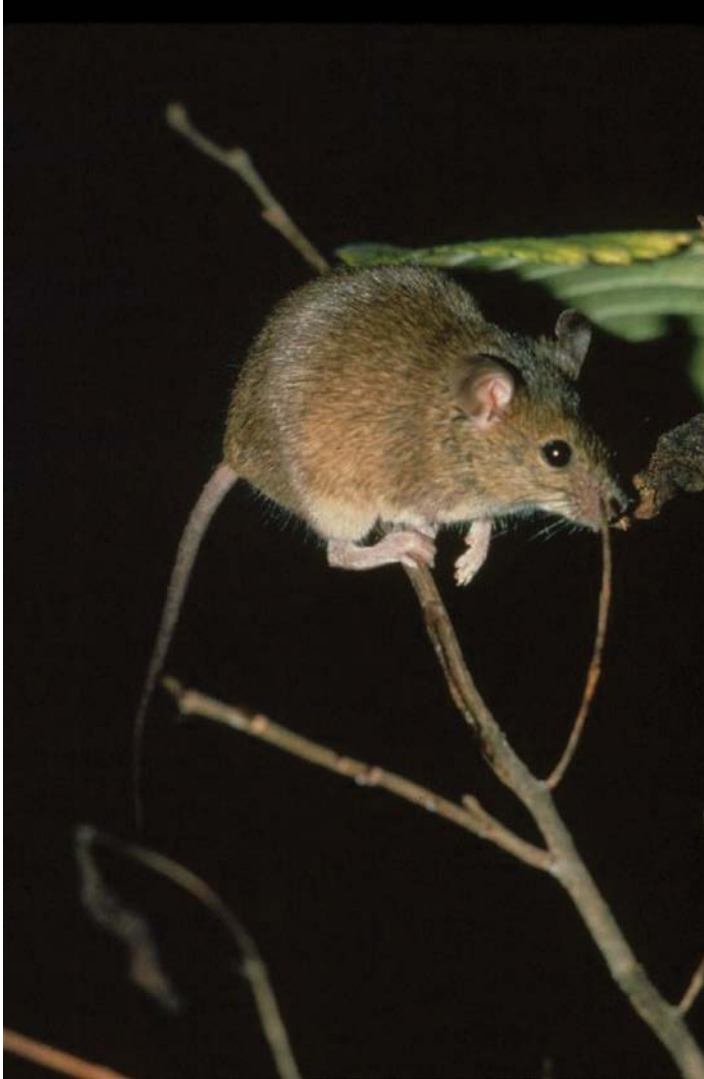
FIGURE 10.6 House mice have amazing abilities which allow them to access almost any available area or resource. (Photo source unknown.)

importantly, they damage insulation and wiring (Hygnstrom 1995). House fires have been caused by mice gnawing electrical wires; likewise, communication systems have been shut down for periods of time, resulting in economic losses (Timm 1994b). Additionally, house mice are susceptible to a large number of disease agents and endoparasites. Consequently, they serve as reservoirs and vectors of disease transmission to humans, pets, and livestock (Gratz 1994). Important among these diseases are leptospirosis, plague, salmonella, lymphocytic choriomeningitis, and toxoplasmosis.