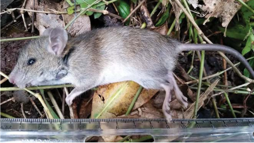
FIGURE 10.4 Adult Polynesian rat (approximately 11 cm body length) that is anesthetized to fit a radio-collar for tracking movement patterns in a montane forest on Oahu, Hawaii.

1997; Matisoo-Smith and Robins 2004). Like the other invasive rodents discussed, Polynesian rats are opportunistic omnivores, and their diets vary greatly by what is available according to season and location so as to exploit locally abundant food sources (Kami 1966; Kepler 1967; Fall et al. 1971; Crook 1973; Tobin and Sugihara 1992; Sugihara 1997; Rufaut and Gibbs 2003). In general, their diet is nearly equally split between plant material and arthropods (Shiels et al. 2013; Shiels and Pitt 2014). Predators of Polynesian rats include mongooses, cats, other larger rodents, and birds (Marshall 1962). In addition, many Polynesian cultures consider this rat to be a valuable food resource, and this species and other rodents may have been introduced into new areas intentionally for food (Spenneman 1997).