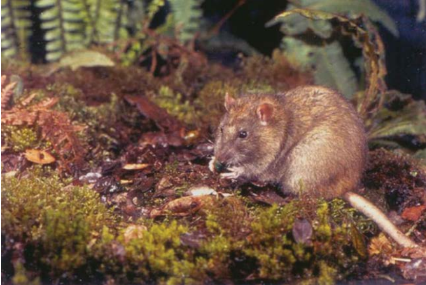
FIGURE 10.1 Introduced rodents, such as this Norway rat ( Rattus norvegicus ), can cause extensive damage to island flora and fauna and to agricultural production.