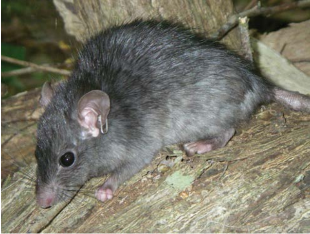
FIGURE 10.2 Roof rat in native Hawaiian forest. Note the metal ear tag on the characteristically large ears.

and their movements, roof rats, particularly in warmer areas, readily establish in undeveloped areas, including native forests in Hawaii and on oceanic islands (Shiels et al. 2014). According to Brooks (1973), roof rats were well established in Virginia in the early 1600s and in North America's east coast areas by the 1800s. They occur sporadically in warmer inland areas but rarely persist. However, a recent infestation discovered in urban Phoenix, Arizona raised concerns that the species could permanently establish in patches of suitable habitat and subsequently threaten crops and orchards (Nolte et al. 2003). In cooler temperate areas, roof rats compete poorly with the larger and more aggressive Norway rat, and occur mostly in port areas and generally indoors (Meehan 1984). However, in island natural areas, particularly forests, roof rats have been identified as the most destructive rodent to native species and ecosystems (Ruffino et al. 2009; Traveset et al. 2009; Banks and Hughes 2012; Shiels et al. 2014).