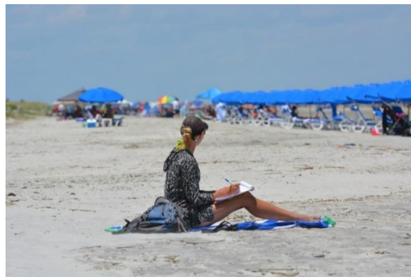
Photo H. The researcher observing smoking and discarding behavior by sitting in the “channel,” multiple yards away from the smoker.

For this reason, it was imperative that the researcher be able to view the smoker during their smoking activity, and subsequent discard. To do this, whenever the researcher located someone smoking she would remain in the area where that smoker was. The researcher often sat down in the aforementioned “channel” between the dunes and the smoker. She typically sat multiple yards away from the smoker and off to one side or the other of them thus remaining inconspicuous as she observed the smoking behavior and subsequent discard of the cigarette butt (refer to Photo 4). A small pair of binoculars were utilized to observe the discard action to ensure that they “butt’s” discarded location could be confirmed.