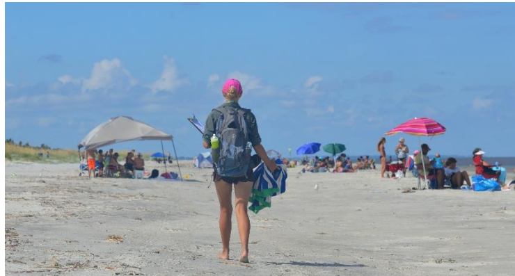
Photo G. Researcher walking in the “channel,” between most beachgoers and the dunes.

The researcher located smokers by utilizing a variety of senses. She paid special attention to any white objects in beachgoer’s hands, watched for movements of beachgoer’s hands to their mouths, and watched for puffs of smoke in the air. Importantly, she also used her sense of smell and found that if she was standing downwind of a smoker she could smell smoke from 25 yards away and up. Interestingly, the sense of smell became very important as it was often the first sense that detected smoking, and her eyes were then utilized to pinpoint the individual smoking, and subsequently observe the discarding action.