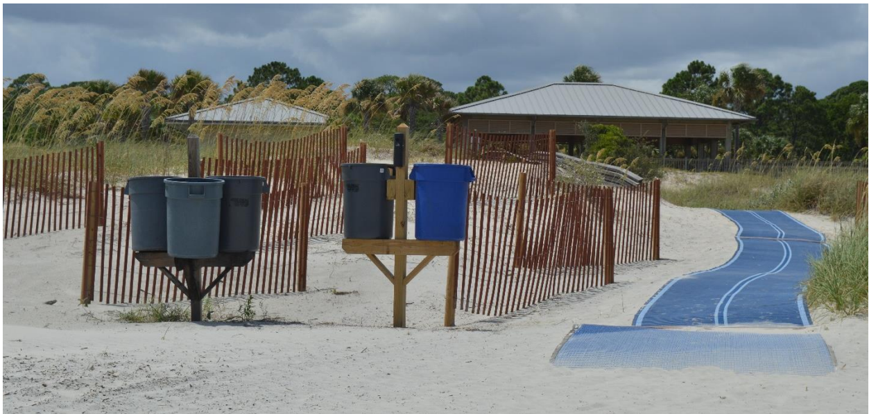
Photo 2. Cigarette receptacle mounted on pole at beach access point that already contained trash and recycling receptacles