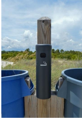
Photo 1. Black cigarette receptacle installed by researcher at six beach access points.