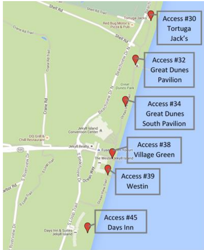
Figure 1. Map showing beach access points where the researcher placed cigarette butt receptacles. Distance between beach access #30 and #45 is 0.87 miles.

(Photo 2). Refer to Appendix G for photo documentation of cigarette receptacles mounted at each beach access.