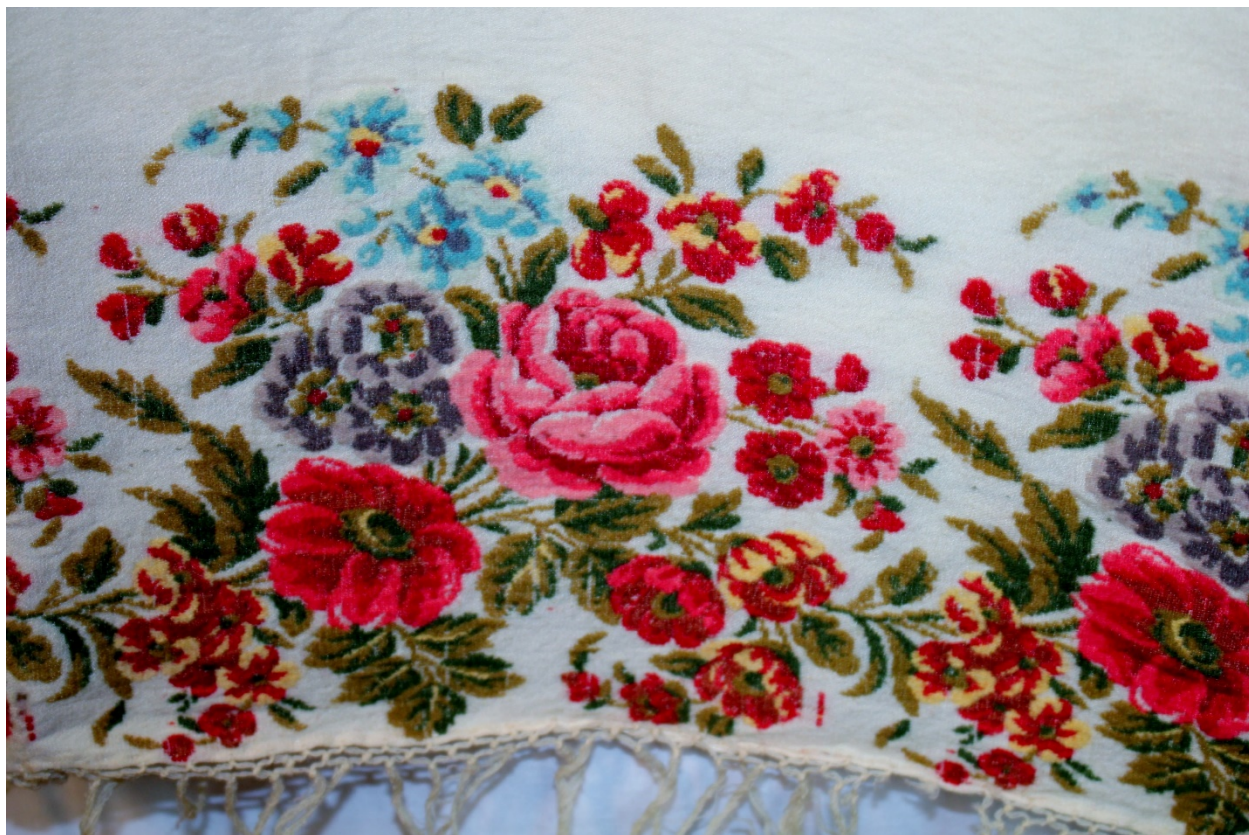
Ternaux shawl, France, 1810. Joan Hart Collection.

By the 1830s and 40s, the demand was so high for the shawls, that production just kept increasing and new designs were constantly invented. There were competitions for shawls that were new and spectacular at the Universal Expositions that were held in Paris, London, and Vienna in the nineteenth century. We know much about the production from the Exposition published reports of awards granted. Merchants were traveling regularly to India to advise the shawl producers of the latest fashion and Indian producers made shawls in imitation of the European ones. However, the designs in India were very popular in Europe until the end of production in the 1870s, despite the intervention of outsiders. Stylistic development in shawl patterns went from very simple long shawls with a single row of paisleys in the early nineteenth century to greater elaboration, the addition of a gallery above the main border area, then the filling in with vining vegetation of almost the entire previously empty central field. 14