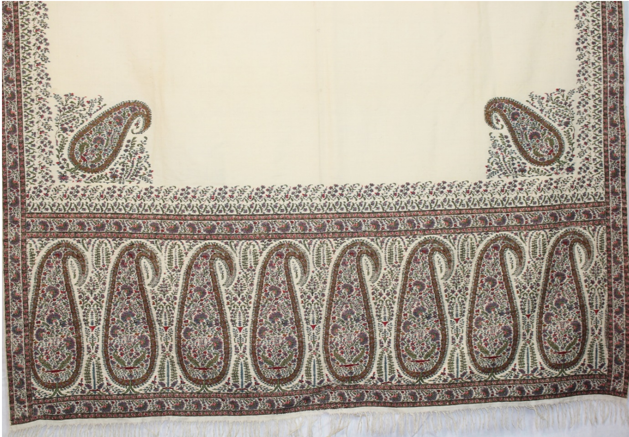
Edinburgh drawloom shawl, 1820s, wool. Joan Hart Collection

The Edinburgh shawls were almost exact reproductions of Kashmir shawls, although the wool was not quite soft enough and the colors were so different that they are clearly not from Kashmir. Generally speaking, the basic European imitation of the Kashmir shawl continued unabated throughout the nineteenth century, but one also sees shawls that are totally unique and unrelated to the Kashmir designs such as the following early nineteenth century paisley origin and Norwich and French examples: The design of the Norwich shawl has a rococo and Asian pattern, while the French early shawl has naturalistic flowers, possibly designed by Isabey, using very rough wool.