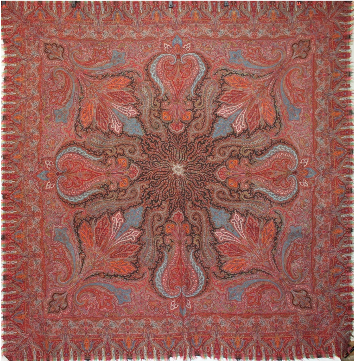
Square Kashmir rumal shawl, double interlock tapestry twill, 1860. Joan Hart Collection.