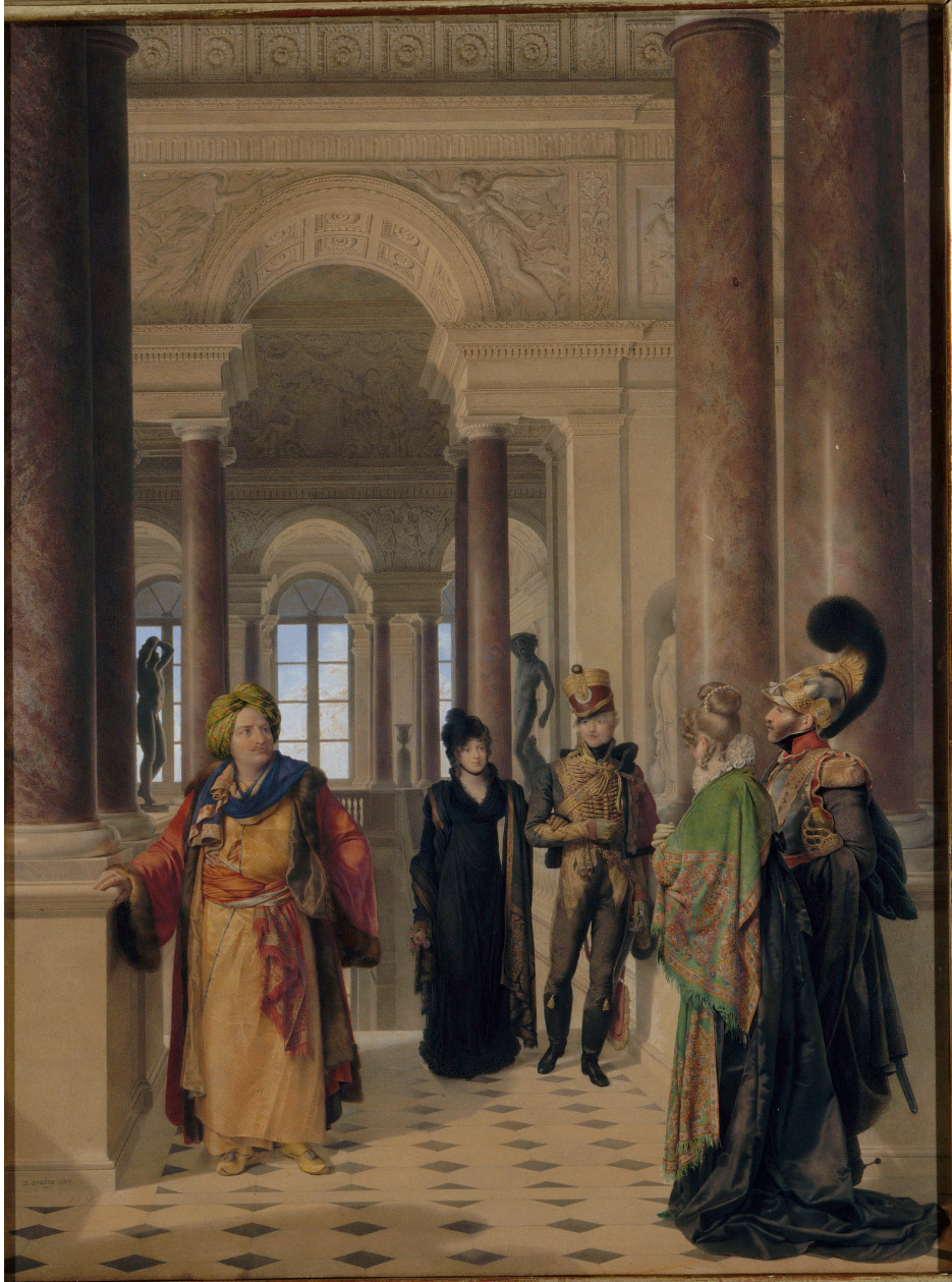
Jean Baptiste Isabey, "The Grand Staircase of the Musée Napoleon" 1804-14, Louvre Museum, Paris

This painting brings the early nineteenth century to the fore with our elegantly dressed Indian gentleman pausing at the top of the staircase of the Louvre and encountering two Empire styled ladies with gorgeous shawls draped around them. What makes this painting even more fun is knowing that the artist Isabey, a wonderful painter and student of Jacques-Louis David, designed the new Kashmir shawls of Paris for many years.