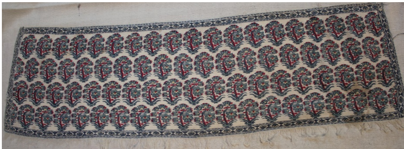
18 th century shawl border, double interlock tapestry weave, Joan Hart Collection.

In the late eighteenth century, we receive some clear information about the Kashmir production: it was already commercial, exported to many areas over horrific routes to the royal courts of Russia, Persia, Europe and beyond and it was a male business. 7 Just about every other textile in the region was produced by women, often for domestic use, such as the phulkaris, embroidered scarves kilims, carpets.