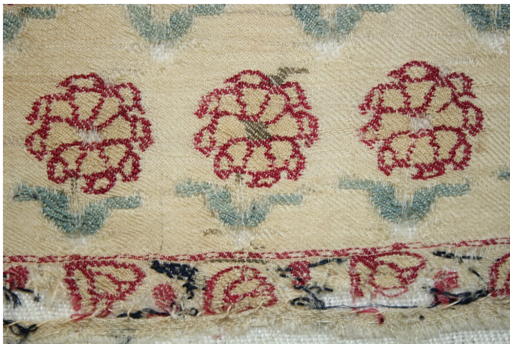
Kashmir shawl detail, c. 1680, tus, double interlock tapestry weave. Joan Hart Collection.

The Kashmir shawl is very special because it combines: a material that is extremely rare and luxurious which we now call cashmere or pashmina, a weave structure that is unique in its region and very complex, a symbolism of design motifs that is still debated, color dyes still not fully explored, a design that is also unique for its region. (All the shawls illustrated in this discussion are from my collection and cannot be reproduced.) It is not possible to provide in-depth coverage of all the peregrinations, changes and influences on shawl creation. I will focus on the eighteenth- to the late nineteenth century developments.