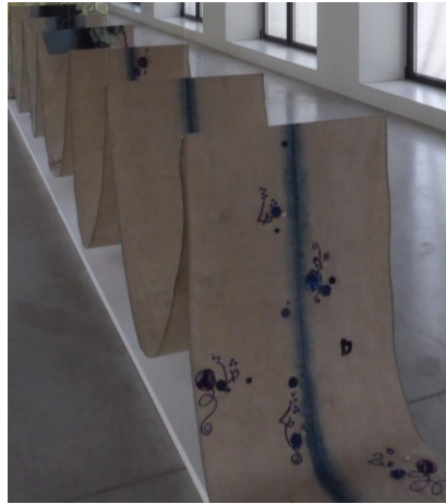
Figure 1: Through the Globe [Através do globo] view from Guimarães. in Residências Artísticas at Casa da Memória [House of Memory], Linen, silk, leather dye, embroidery. 14m x 0.58cms x 0.25 cms.

An antipodal journey begins, Wellington 41.3366566 South Divergent in Guimarães 41.44253 North Guimarães, ancient, medieval, times past the tannery as economic hub Wellington, young, Pacific