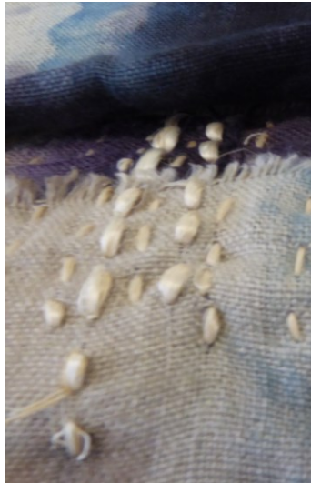
Figure 7: Muka embroidered in atrás stitch on dyed linen.

Two places merged in one blue sea, And I Took the place less travelled Through the Globe [ Através do globo ] And, stitch, dye, and technology interrupted tradition to make the difference.