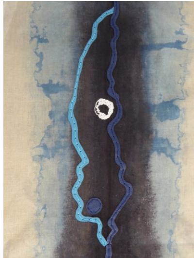
Figure 5: Die cut leather embroidered onto dyed linen.

Laser cut silk flower motifs evoke Farewell Spit Squeezed through the Earth's core To lie amongst the imaginary shadows and protrusions of the landmasses An interplay with the translation of traditional Guimarães embroidery.