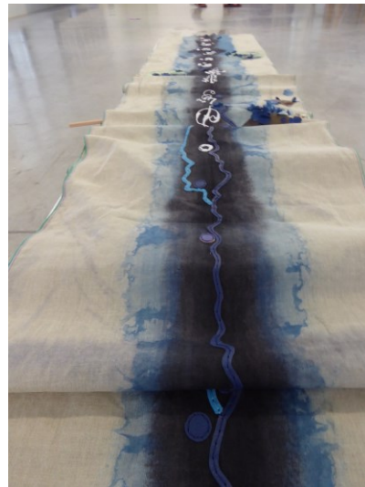
Figure 2: Through the Globe , from the south.

An antipodal journey begins, Wellington 41.3366566 South Divergent in Guimarães 41.44253 North Guimarães, ancient, medieval, times past the tannery as economic hub Wellington, young, Pacific