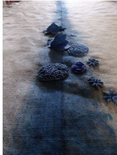
Figure 3: Embroidery on dyed linen detail.

Clematis vitalba, Old Man's Beard, golden hues from Hokianga Migrates along the fibre A pest that loves to smother indigenous trees And now fluidity, to blend or contrast with other colour Left turns, right turns, no exits and pathways forward.