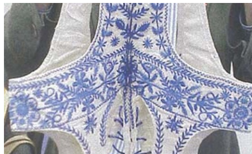
Figure 4: Traditional early twentieth century waistcoat in University of Aberdeen Needlework Development Scheme collection. 6

And the essence of 'traditional' embroidery And to Oficina to translate And what matters, technical virtuosity Canutilhos, nozinhos, atrás, pé-de-flor, cadeia traditional red or Guimarães grey.