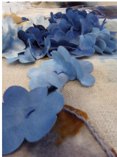
Figure 6: Laser cut silk flowers embroidered onto linen.

Laser cut silk flower motifs evoke Farewell Spit Squeezed through the Earth's core To lie amongst the imaginary shadows and protrusions of the landmasses An interplay with the translation of traditional Guimarães embroidery.