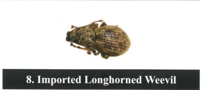
8. Imported Longhorned Weevil