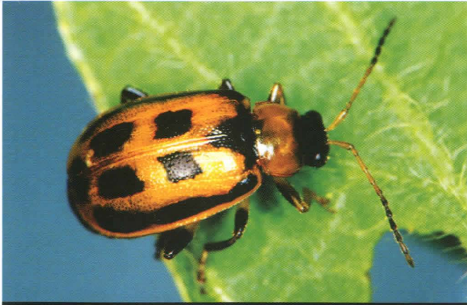
1. Bean Leaf Beetle