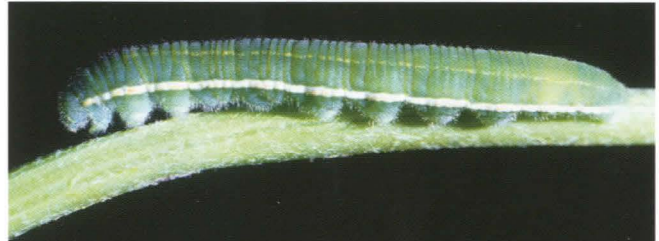
4. Alfalfa Caterpillar