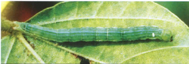
3. Green Cloverworm