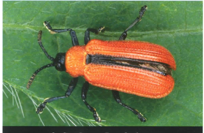
2. Soybean Leafminer