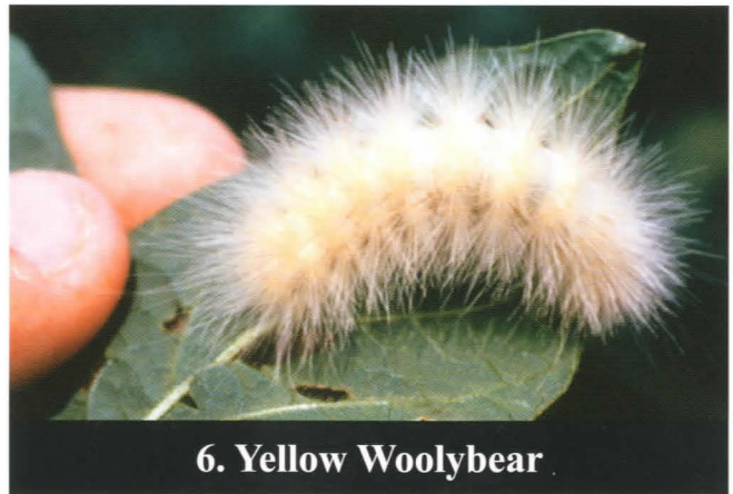
6. Yellow Woollybear