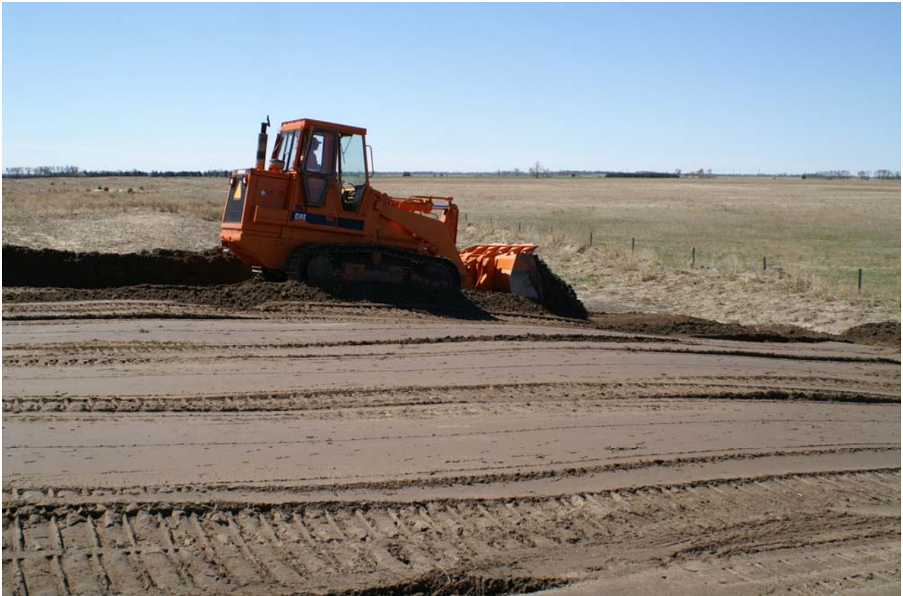
Figure 4. Shaping the transplant site.

Seedlings in the pilot study were monitored through 2005. A number of seedlings were lost because of water erosion. It became apparent that the slope was too great.