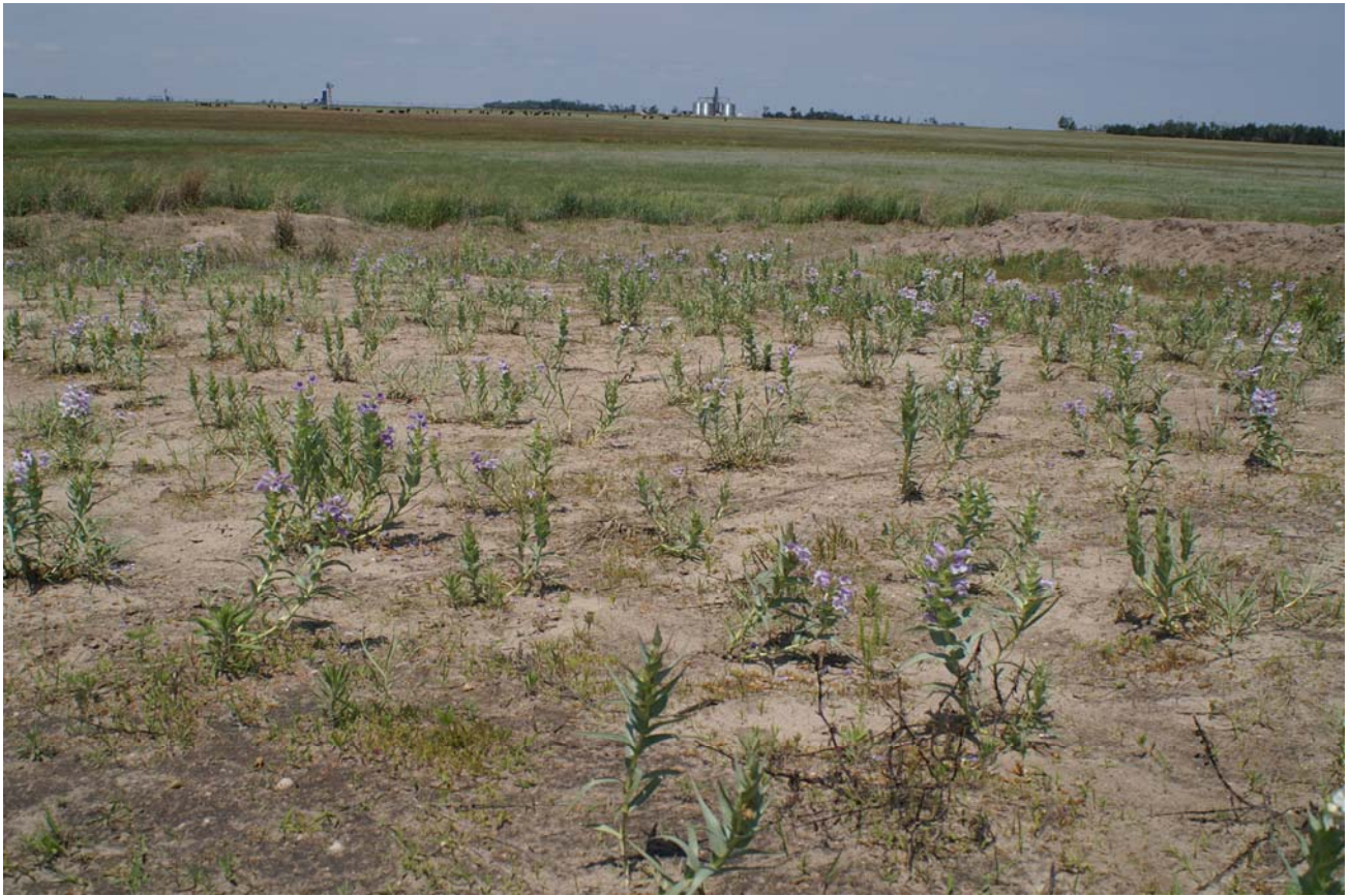
Figure 6. Blowout penstemon plants blooming on the research site.

The soil at the site was damp when the seedlings were transplanted in 2007, and additional precipitation occurred soon after transplanting. While survival of the 2007 transplants will not be determined until 2008, conditions have been favorable.