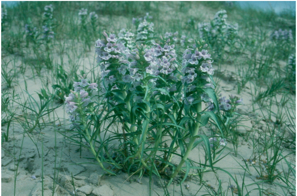
Figure 1. Blowout penstemon ( Penstemon haydenii S. Wats.)