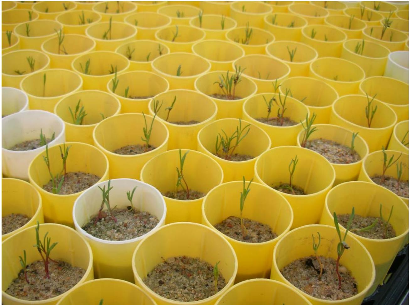
Figure 3. Blowout penstemon seedlings in the greenhouse.

Six to eight seeds are dropped onto wetted media in each tube and covered with sand to a depth of about 6 millimeters (0.25 inches). The sand is wetted with a water mist. Each rack of 98 tubes is covered with clear plastic food wrap to prevent water loss. Seedlings begin to emerge within a week (Figure 3). The plastic wrap is removed when the seedlings grow tall enough to start to contact the wrap. Initially, lower temperatures in the greenhouse keep small seedlings from drying out and burning. For a few weeks, seedlings are watered with a fine mist so as not to dislodge the developing root system. At four to six weeks, the seedlings are thinned to one seedling per tube. Fertilizing the plants with a high phosphorus fertilizer once each week is helpful in maintaining good root growth. Clipping the seedlings at eight to ten weeks of age to leave three to four pairs of leaves may slow stem elongation and encourage root growth.