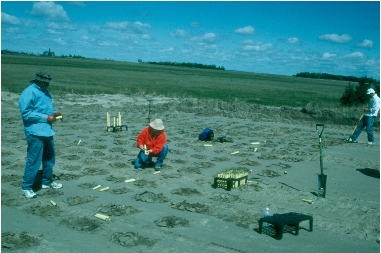
Figure 5. Transplanting seedlings on the research site.

Surviving seedlings were counted in the spring of 2006 and 2007. Data on numbers of flowering plants and flowering stalks were collected in the spring of 2006 and 2007.