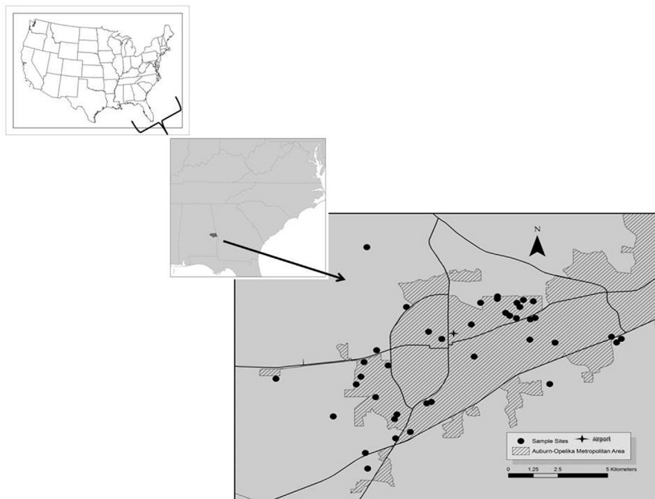
Fig. 1. Stormwater impoundments surveyed (May 2008–2010) in the Auburn-Opelika Metropolitan area, Lee County, AL, USA, for use by avian guilds recognized as hazardous to aviation safety (DeVault et al., 2011).

retained water in the weeks prior to the beginning of field observations. Because of private ownership, final site selection depended upon access to properties from land owners.