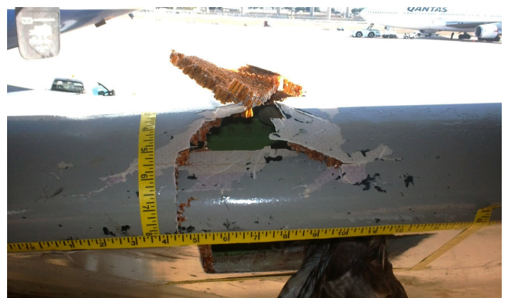
Figure 2. On average, about 38 wildlife strikes with U.S. civil aircraft are reported to the Federal Aviation Administration every day.

To comply with ICAO standards, the FAA mandates that airports in the U.S. initiate formal assessments of wildlife hazards, referred to as Wildlife Hazard Assessments (WHAs), when certain triggering events occur, such as a