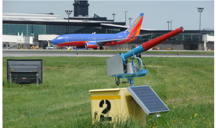
Figure 8. The use of auditory repellents, such as propane exploders or cannons, are part of an integrated approach for reducing wildlife risk. Periodically changing their locations, as well as their frequency and timing of stimuli, can increase their effectiveness.

Along with vision and smell, auditory (hearing) and tactile (touch) are categories of primary physical receptors in birds and mammals. These receptors can be triggered by repellents and influence animal behavior. Thus, auditory and tactical repellents can be important tools for reducing hazardous wildlife at airports when used within an integrated wildlife management strategy. Auditory repellents can be any device that produces sound in the audible (to most vertebrates; 20 Hz-20 kHz) through the ultrasonic range (some rodents and bats; >20 kHz-200 MHz). Tactile repellents can be spikes of various designs, electric shock, tacky or sticky substances, moving or static wires, or chemical compounds designed to create pain or discomfort. Auditory repellents are generally used to disperse birds and mammals from larger open areas