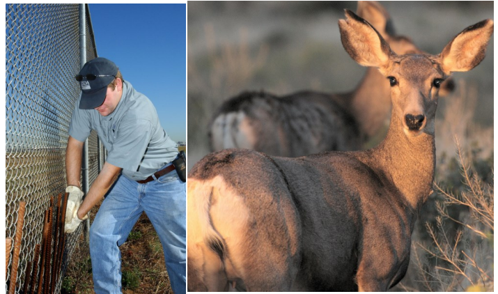
Figure 6. When well-maintained, 10-foot or higher chain-link fencing is extremely effective in excluding hazardous mammals, such as deer, from critical areas and is ideal for airport use.

Regardless of the type of fence and gates used at an airport, it is vital that they are checked regularly and that breaches are repaired as soon as they are discovered. Deer, coyotes, and other mammals hazardous to aircraft will quickly find and use fence gaps and holes. Furthermore, research conducted at the USDA, Wildlife Services, National Wildlife Research Center suggests that white-tailed deer will rarely attempt to jump an 8-ft (2.44-m) fence, even when their lives are threatened. Thus, a well-maintained 8-ft (2.44-m) fence is generally more effective at excluding medium- and large-sized mammals from critical airport areas than a neglected 12-ft (3.66-m) fence. However, irrespective of fence height, it is unlikely that any airport fence will be completely mammal-proof. Whenever deer or other mammals hazardous to aircraft are found within airport perimeter fences, they should be removed immediately to eliminate the risk of damaging aircraft strikes.