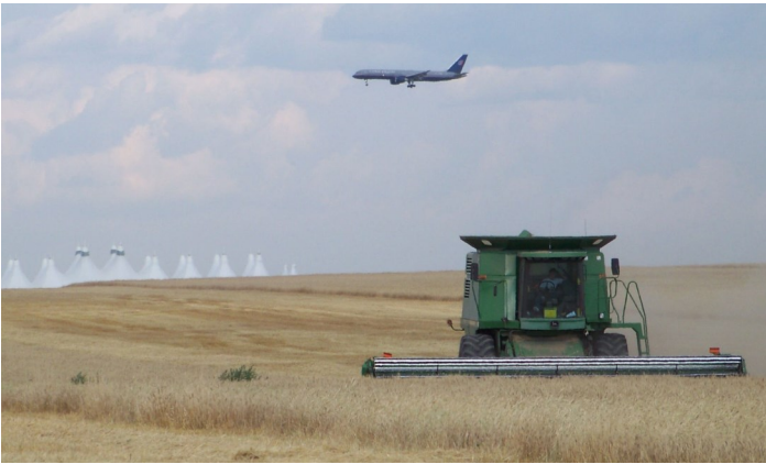
Figure 5. Some airports, particularly general aviation airports, plant agricultural crops within or immediately adjacent to airport property. Although planting crops can generate revenue, many agricultural crops are attractants to hazardous wildlife and not recommended.