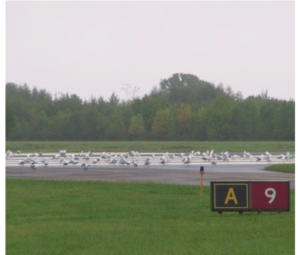
Figure 1. Gulls rest on an airport runway.