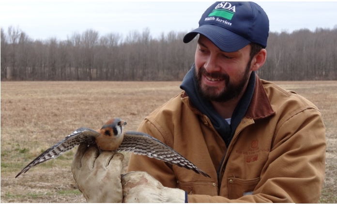
Figure 7. Translocation is a nonlethal option for managing raptors, such as this American kestrel, at airports.

of some species because of the potential to introduce wildlife diseases to new areas. Also, translocation is labor-intensive and thus expensive (although costs have not been formally quantified), and relocated raptors sometimes return to the airport where they were captured. Furthermore, survival rates of translocated individuals are not well understood, and it is unclear how translocation affects established animal communities at relocation sites. In general, more research is needed before translocation can be used most effectively at airports.