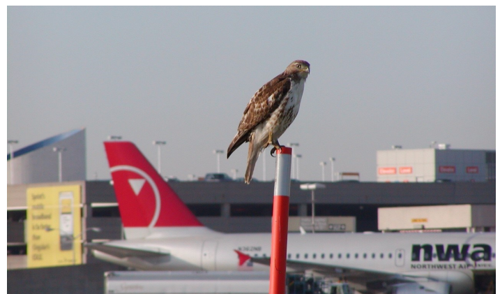
Figure 4. Raptors (e.g., hawks and owls) use airport grasslands and weedy areas to hunt for small rodents and other mammals.

Surface water, including natural water bodies, poorly drained areas, aquaculture facilities, and exposed stormwater detention/retention facilities often represent a substantial portion of the area within FAA siting criteria for certificated U.S. airports (i.e., surface water within 1.5 km of a runway for airports servicing piston-powered aircraft and within 3.0 km of a runway for airports servicing turbine-powered aircraft). All of these water resources on and near airports can serve as attractants to wildlife and pose hazards to aviation safety. Unfortunately, the management of water resources intended to achieve water quality goals and provide safe operating surfaces for aircraft is often at odds with management intended to minimize attractants to birds and other wildlife. Thus, effective water management on and near airports to reduce hazards to aviation depends on collaboration among airport biologists, airport