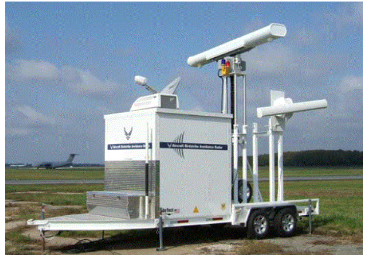
Figure 9. The FAA and several research partners in government (i.e., USDA, Department of Defense) and academia continue to investigate the capabilities of avian radar and its potential efficacy of use at airports.

There are several types of radar that have been used to monitor birds, including marine surveillance radars, tracking radars, weather surveillance radars, and terminal Doppler weather radars. Marine surveillance radars are most commonly modified for use at airports, which often are referred to as “avian radars”. These usually have 3-cm