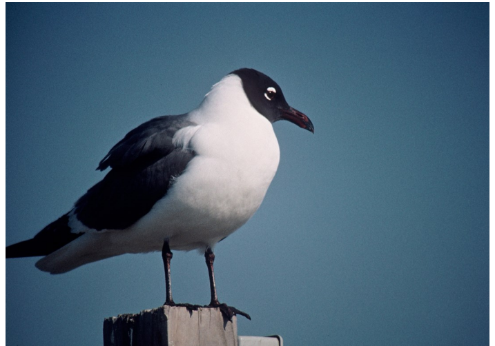
Figure 3. Most bird species in North America are federally protected under the Migratory Bird Treaty Act and their capture or lethal removal requires a permit. When implementing a Wildlife Hazard Management Plan, airport personnel must abide by relevant local, state and federal laws and regulations concerning birds and other natural resources.

One highly regulated activity at the state and federal levels is legal take (lethal removal) of wildlife. At the federal level, recommendations from USDA are required for the application process to obtain a migratory bird depredation permit administered by the Department of Interior (U.S. Fish and Wildlife Service; FWS). Permits are issued with strict guidelines and this process is identified in the Federal Code of Regulations. Data on wildlife use of the