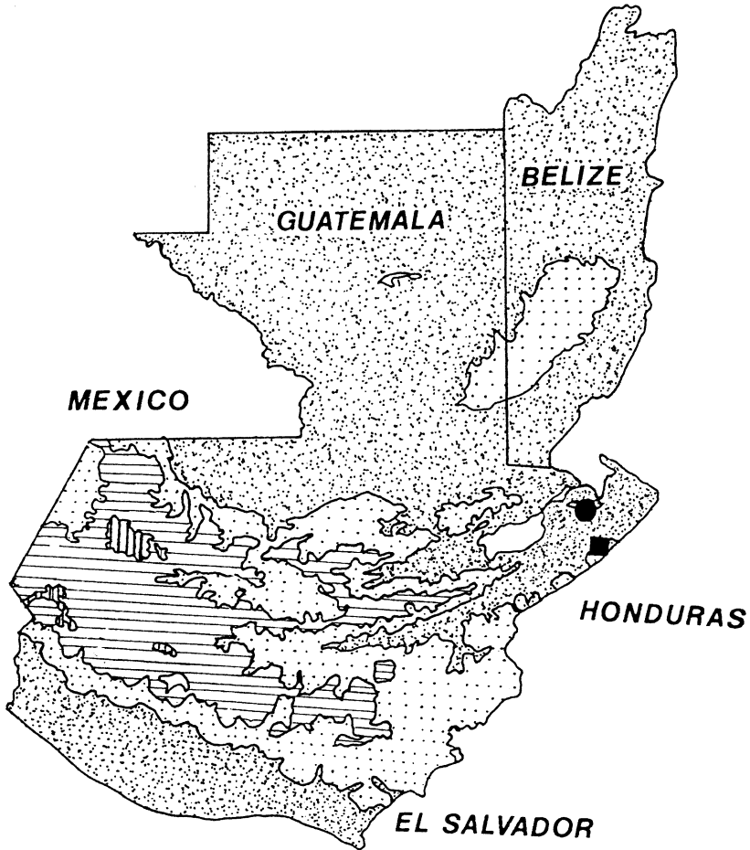
Fig. 1. Distribution of Petrejoidea caralae New Species . Square = Sierra de Caral, circle = Cerro San Gil. Elevations: 0-500 m = irregular dots, 500-1500 m = regular dots, 1500-2500 m = horizontal lines, >2500 m = vertical lines.