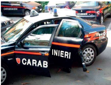
Photo 9: Text 15. No caption

In the images, over-representation was accomplished through a metonymy such as VEHICLE FOR INSTITUTION in which the police car, or part of the car, metonymically stands for Italian law enforcement in general as in the following photograph: