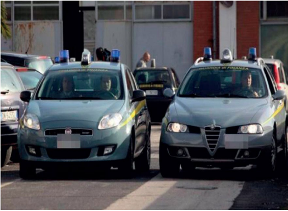
Photo 5: Text 20. Yellow flames

Operation “Arab Phoenix” that brought the arrest of 47 people (29 to prison and others on house arrest).)