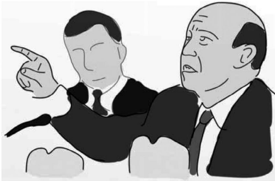
Photo 4: Text 6. CEO Lloyd Blankfein has drawn heat for Goldman’s rich pay and profits in the wake of the tax-payer bailout of the financial system. This drawing is similar to the photograph in the original article. View the original photograph at: http://www.wsj.com/articles/SB10001424052702303491304575187920845670844

In the following photo, extension/contrast is shown through four metonymies in the image in relation to the caption: