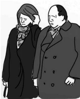
Photo 3: Text 8. Stewart leaves the courthouse with her attorney, Robert Morvillo (right), after the verdict. This drawing is similar to the photograph in the original article. View the original photograph at: http://money.cnn.com/2004/03/05/news/companies/martha_verdict/

Another example of extension/contrast is through the metonymy CLOTHES/OBJECT FOR (high) STATUS, as seen below.