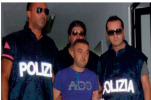
Photo 10: Text 19. Lex boss Antonino Lo Giudice [The ex-boss, Antonino Lo Giudice] View the original photograph at: http://www.lastampa.it/2013/11/15/italia/cronache/arrestatolex-boss-lo-giudice-era-fuggito-dai-domiciliari-KxVginoxoh-B5o0AFMMKPOJJ/pagina.html

In addition to the positive portrayal of law enforcement, two texts also represent Mafia individuals positively while two represent them negatively (in a mug shot in Text 12, Photo 8 (above) and handcuffed and standing next to two giant police officers in Text 19, Photo 10).