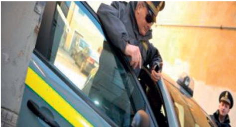
Photo 6: Text 18. Special forces ‘Yellow flames’. View the original photograph at: http://www.ilgiornale.it/news/cronache/ndrangheta-retacolletti-bianchi-47-arrestati-e-90-964973.html

Photos 5 and 6 display the way in which police cars and police car parts function in Italian texts to stand for the actions of the investigation. In Photo 5, the activated blue sirens and headlights of the police cars are metonymic signs of the dynamic, quick and active pursuit of Mafia criminals by the Fiamme Gialle [Yellow Flames] of Naples. The name Yellow Flames is based on the metonymy POLICE CAR DECORATION FOR (NAME OF) SPECIAL POLICE UNIT/FORCE