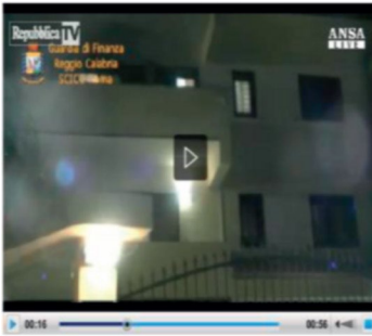
Photo 2: Text 17. Ndrangheta: 47 arresti tra ‘colletti Screen shot from video taken by the authors. View the original video at: http://www.repubblica.it/cronaca/2013/11/06/news/ndrangheta_47_arresti_tra_i_colletti_bianchi_-70323241/

This relation between text and image is sometimes called “anchorage” (see Barthes 1977, 38–41) because the assumption is that the image comes first and the text provides a fixed or specific meaning for it. However, we agree with van Leeuwen that the relation between the image and the text is not linear and that “every link is, at least in principle, reversible” (2005, 230) and reciprocal.