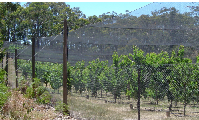
Figure 3. Netting must be properly installed and maintained to be effective.

Bird responses to specific devices depend on a number of factors, including availability of alternate food sources, the