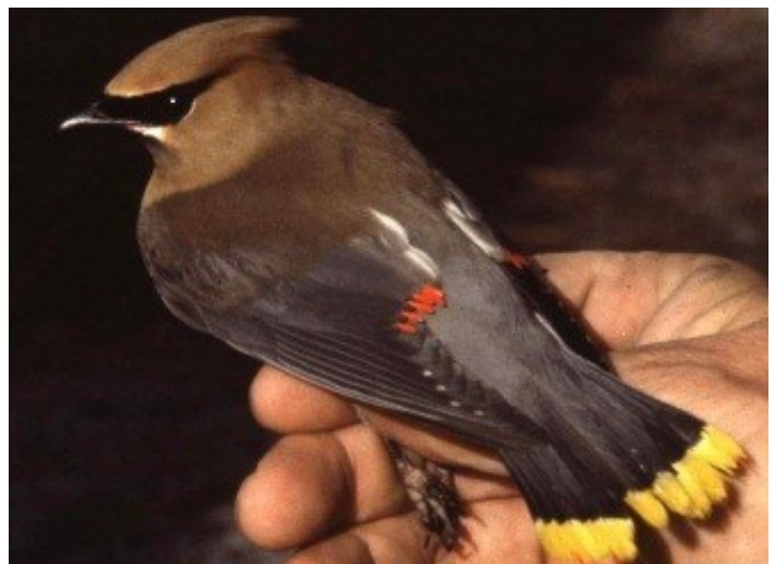
Figure 4. Cedar waxwings are named for the red wax-like tips on their secondary flight feathers.

This is one of the latest nesting species in North America. Egg-laying occurs from early June through early August. Occasionally, active nests are found into early October. Breeding probably commences earlier at lower latitudes, and timing is probably keyed to availability of ripening fruit.