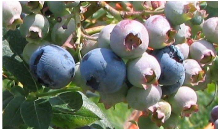
Figure 2. Cedar waxwings often damage fruits without removing them.

Cedar waxwing flocks react to harassment by people on ATVs using pyrotechnics or other loud noisemakers by lifting off, flying out of range, and settling down again. If driven out of the field, they likely will perch in nearby trees, and then swoop into the field once more when the threat of harassment decreases. Permanent removal of birds from a blueberry or strawberry field requires persistent harassment throughout the day. Physical harassment in combination with chemical repellent applications, visual