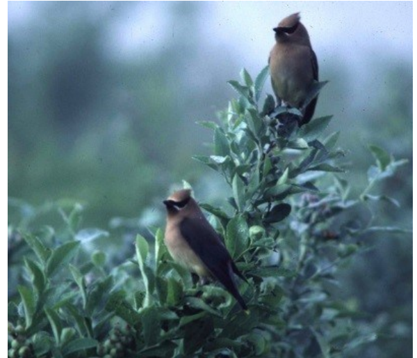
Figure 1. Pair of cedar waxwings ( Bombycilla cedrorum ) on a blueberry bush, Gainesville, Florida.