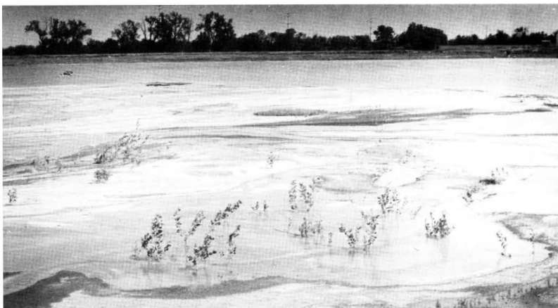
Overlook of nest Three, looking south, 18 June. The nest is just to the left of the dense mat of vegetation above the photograph's center.

Nest Six was first found on this date. It, too, contained four eggs. No adult Plovers were in the nest's vicinity. Nest Five generated some defense display, but the behavior was less intense than the displays of the nest Three adults. The displays did not intensify even as the observers approached the nest. There was very little adult activity around nest Four. Nest Four and Five also contained four eggs each.