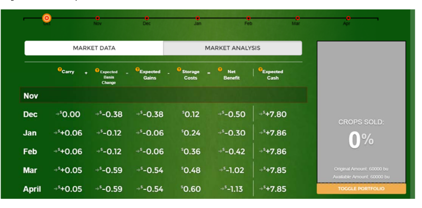
Figure 3: Price Analysis Table