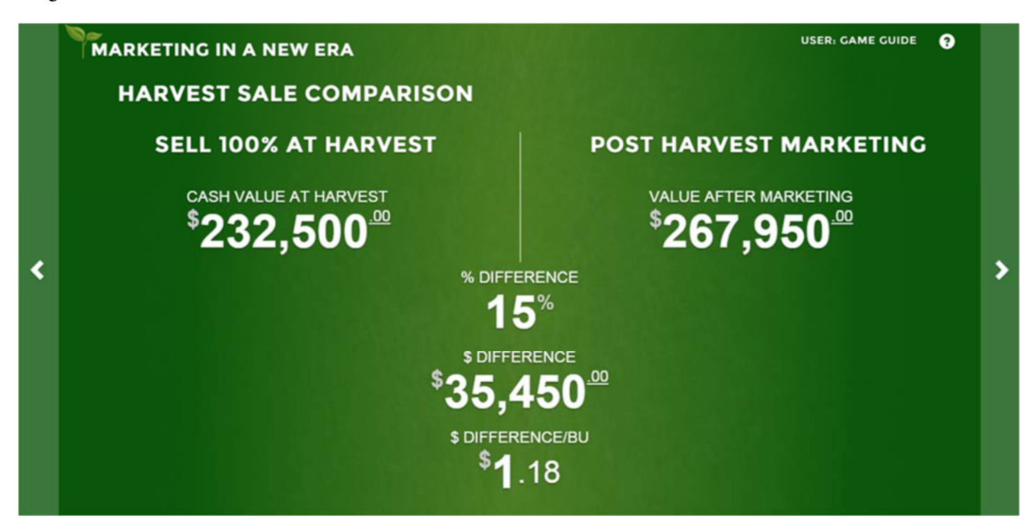
Figure 5: Group Summary Chart