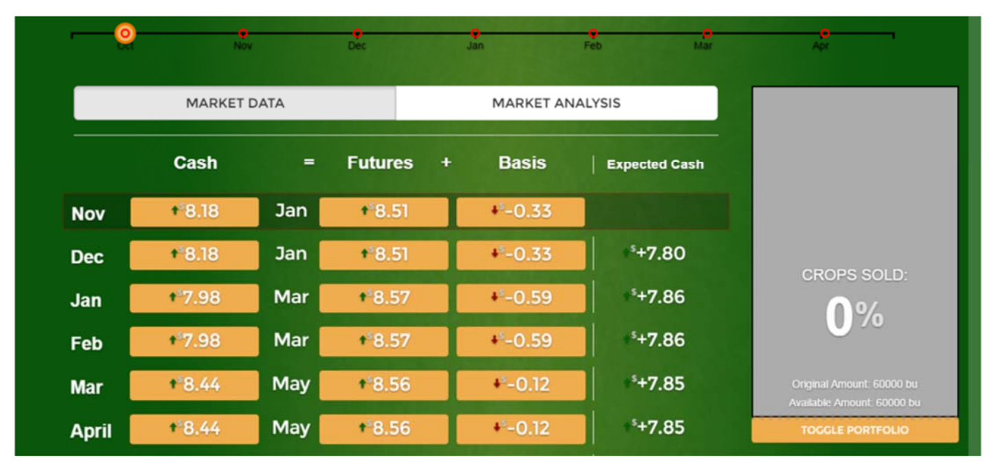
Figure 2: Price Table

future prices is displayed. Producers make decisions based upon the prices and once they complete their decisions, they move forward to the next decision point. MINE offers a market analysis to assist in decision making (Figure 3). At the end of the game, they review their individual results (Figure 4) as well as the other producers' results (Figure 5). Results are presented in a format to allow producers the opportunity to evaluate their performance relative to the maximum and minimum profits they can make with and without marketing. The Extension Specialist concludes the session with a discussion about the optimal strategy under the given prices and how producers could have reached it.