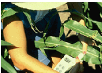
Figure 1. A chlorophyll meter in use.

Researchers have been looking for ways to increase fertilizer N use efficiency. The use of a soil test to adjust fertilizer N rates for residual nitrate works well under Nebraska conditions and producer acceptance of the practice is increasing. However, the potential exists to "fine-tune" N management decisions during the growing season to react to changing weather and crop conditions.