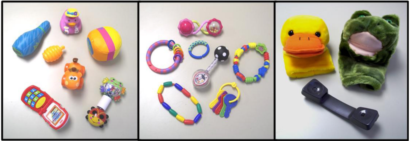
Figure 2. Test Conditions: LargePlay, SmallPlay, Social