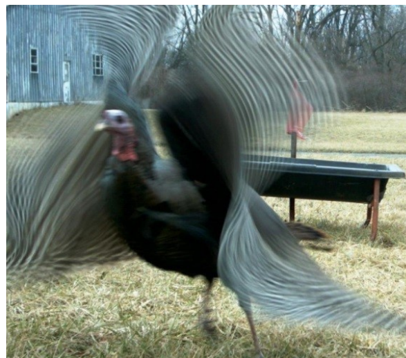
Figure 1. Photo of a frightened wild turkey ( Meleagris gallopavo ).