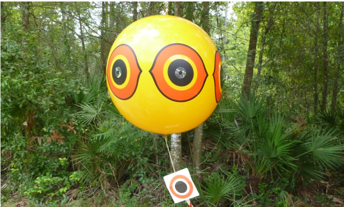
Figure 3. Balloons that have features similar to predators may frighten birds.

breeze. As with the other items mentioned above, unless birds recognize the object as a threat to their safety, they will ignore it or in some cases make use of a device. For example, gulls may incorporate Mylar flags within their nesting material.