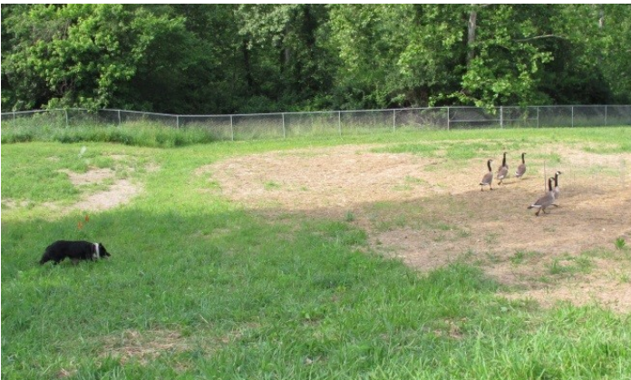
Figure 4. Border collie herding Canada geese ( Branta canadensis ).

Thousands of American crows may congregate in urban winter roosts that create large amounts of fecal contamination of walkways, cars, and other property, as well as night-long cacophony. In some instances, as many as 70,000 crows have been recorded in a single winter roost. Before efforts at reducing the impact of the crows begins, it is critical to set an objective that all parties within the affected area agree with. In the case of crow roosts, the objective may be to splinter the flock into small groups, or to move the crows to alternate areas largely uninhabited by people. It also is necessary to be sure that the birds are not moved to an area in which they could become a significant threat to human health and safety (e.g., moving birds into areas with increased risk of striking aircraft or vehicles).