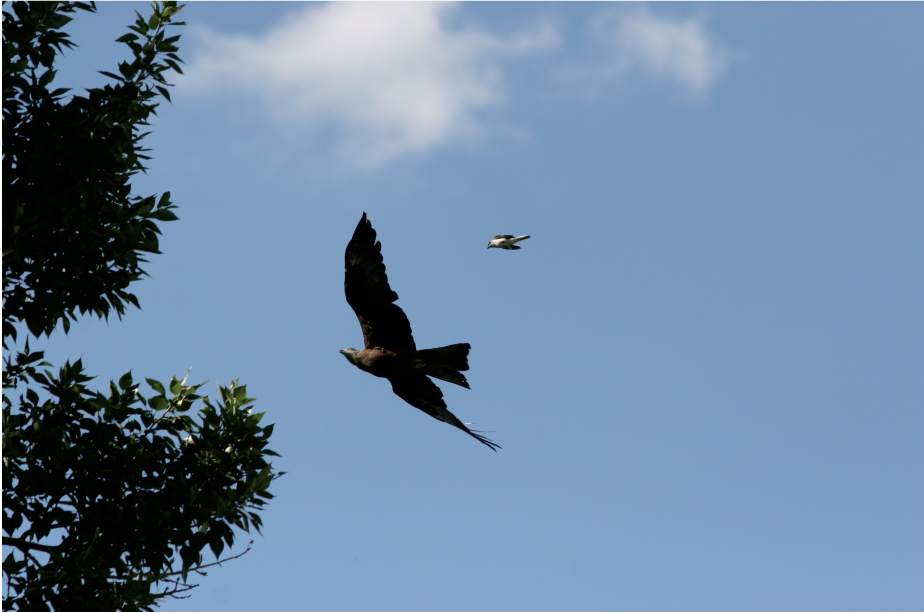
Fig. 2: Another 'male' mobbing an over flying Black-eared Kite Milvus (migrans) lineatus.