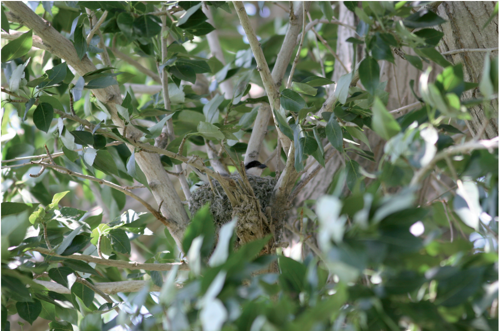
Fig. 1: The 'female' incubating. The nest was found on poplar tree in about 4 m height and about 2-3 m away from the trunk. The corresponding male was often seen sitting in the tree close by.

ground and about 2-3 m off the trunk. Since the adults showed no signs of food transmissions we assume that the female was still incubating. Another territorial pair was found just about 150-200 meters from the first pair's nest. Although we did not find a nest we concluded that this was another breeding pair due to the males' aggressive behaviour against all aerial intruders. For example, the male even attacked a Black-eared Kite Milvus (migrans) lineatus (fig. 2). Interspecific aggression against crows and raptors is not exceptional and has been observed and described before (GLUTZ von BLOTZHEIM 1993). Interestingly we could not detect any intraspecific antagonistic behaviour between the two males though they were sitting on the same fence occasionally less than 50 meters apart from each other. However, males are known to defend mainly the immediate vicinity of the nest-tree, and this in the time of nest building and incubation only (CRAMP 1993).