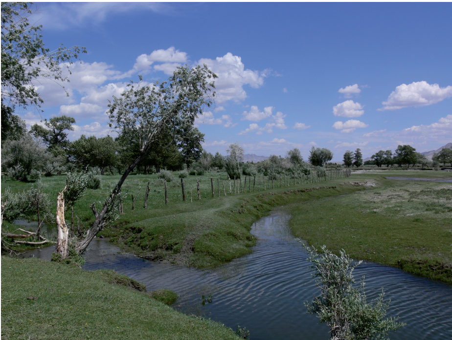
Fig. 3: The habitat of the Lesser Grey Shrike consisting of an open meadow area with scattered bushes ( Salix spec. ) and trees ( Populus sp. ). Two pairs (one with nest) were found here. The males often using the fence as a perch.