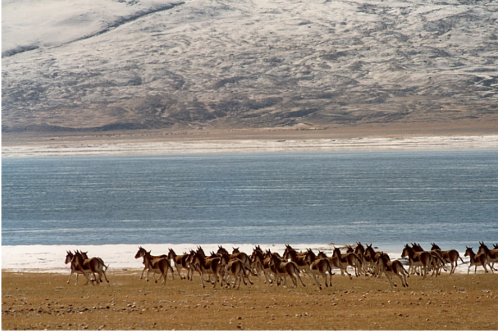
Fig. 2: Kiangs between Hor and Maium La Pass, 19 October 1998.