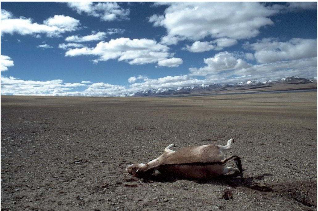
Fig. 6: Poached kiang near Mam Tso Lake.