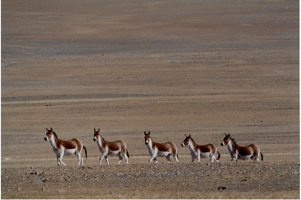
Fig. 4: Kiang group near Maium La Pass, 19 th October 1998 (above).