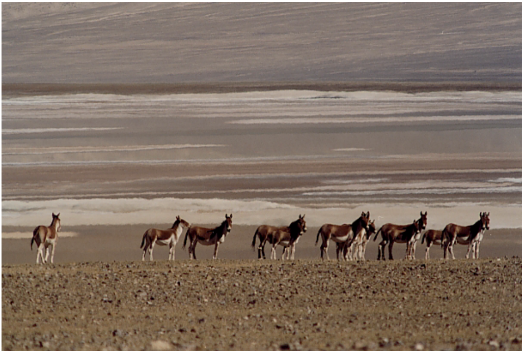
Fig. 3: Group of kiangs near Yanhu, 5 th October 1998.