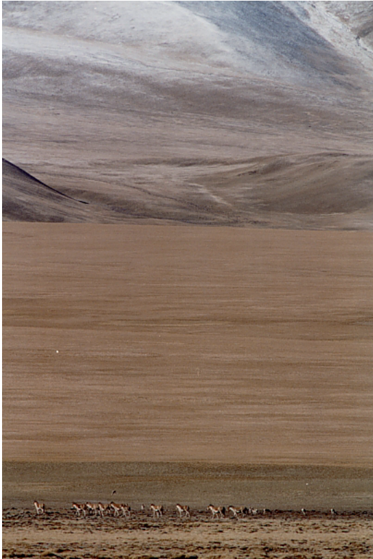
Fig. 5: Kiangs near Lama Tso Lake, 12 October 1998 (left).