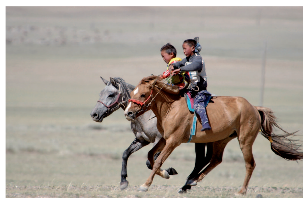
Fig. 4: Children riding domestic horses during a Nadam celebration near the village of Bij at the edge of the Great Gobi B SPA.