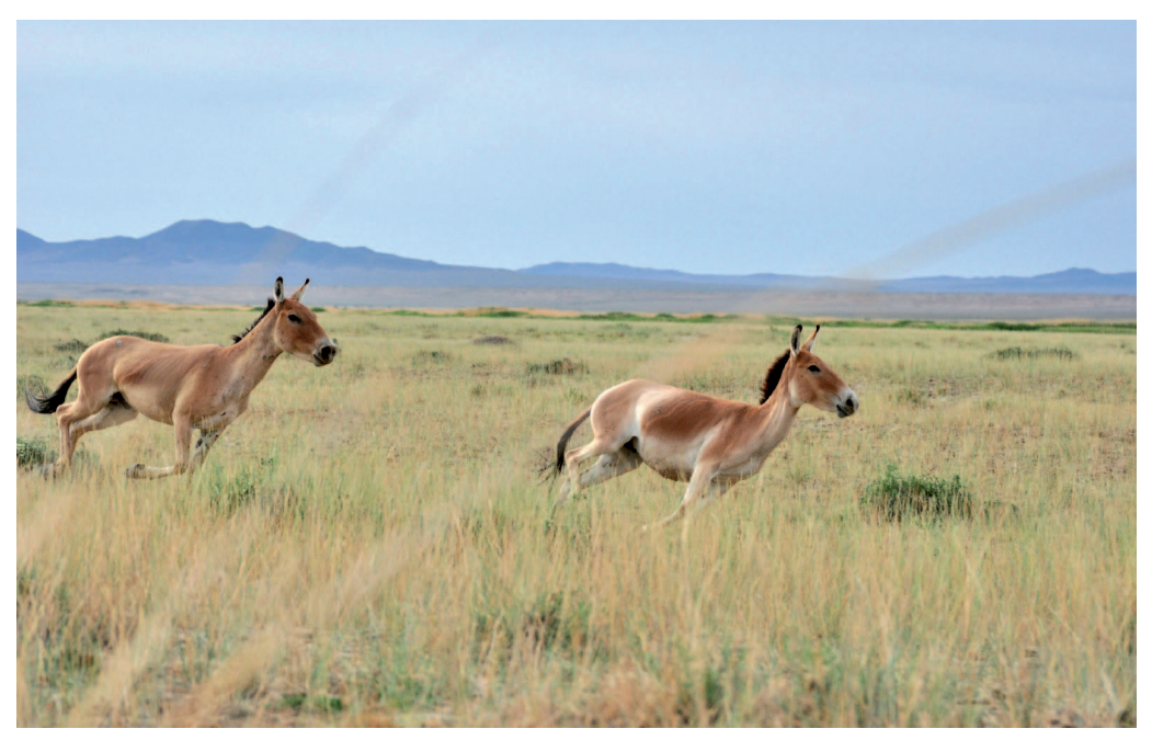
Fig. 1: Stallion and mare Asiatic wild ass at Chonin us oasis in the center of Great Gobi B SPA.