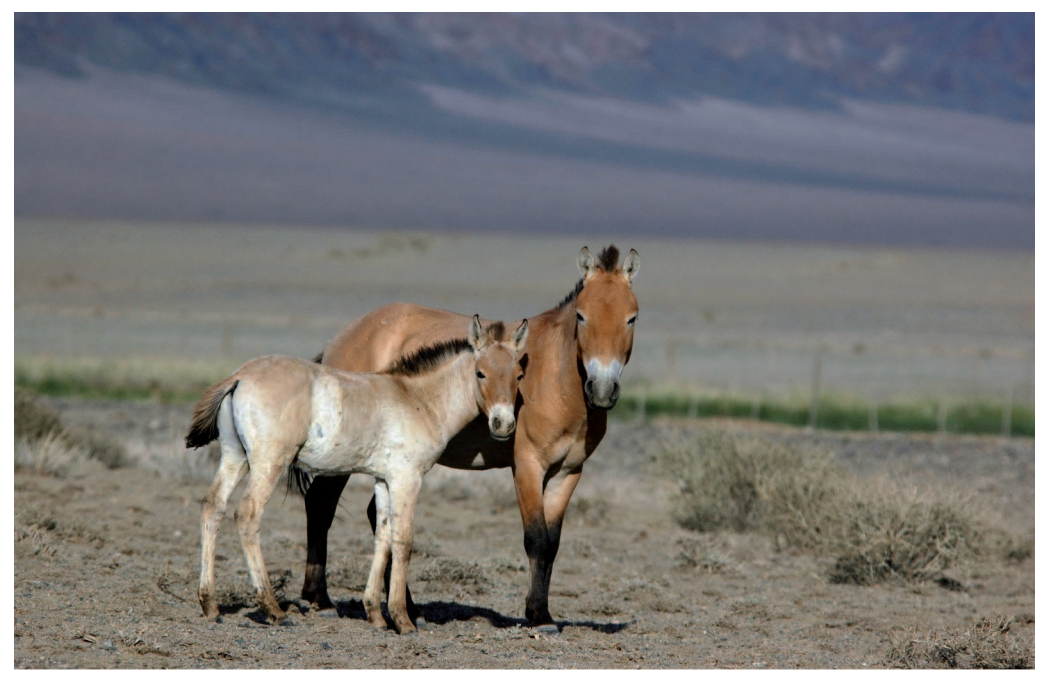
Fig. 3: Przewalski horse mare and foal along the Bij river in the Great Gobi B SPA.