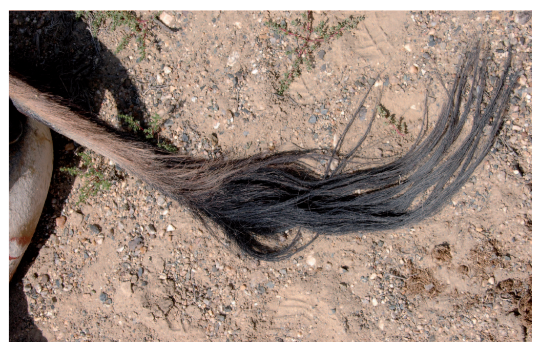
Fig. 2: Tail of an Asiatic wild ass chemically immobilized for radiocollaring in Great Gobi B SPA.