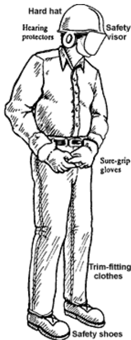
Figure 2. Safety clothing and equipment provide extra protection in the event of an accident.

Before starting the equipment, make these final inspections and adjustments: