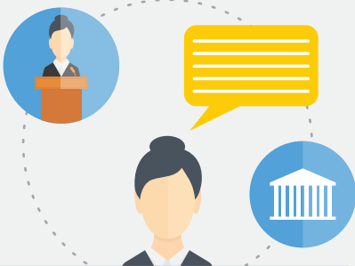
JUSTICE RUTH BADER GINSBURG

Some people think fair use is a minor exception or a marginal carve-out from the expansive protection for authors, but fair use is a fundamental right .