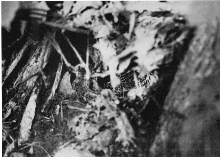
Louisiana Waterthrush nest in Fontenelle Forest

On 5 June 1982, I located a nest of the Louisiana Waterthrush ( Seiurus motacilla ) in Fontenelle Forest. The location had been determined on 26 April when I, with three others, Tanya Bray, Babs Padelford and B.J. Rose, saw a Waterthrush carrying nesting material. This site was later reported as abandoned. I had first seen a Waterthrush in this area on 15 April and identified it as a Louisiana by its song. On 21 April I saw two foraging together. On the date of the nest building they were silent and easily overlooked; but I heard occasional singing on each of my five visits in June.