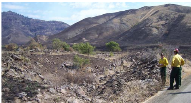
Poe Cabin Fire in Central Idaho in 2007.