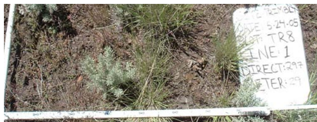
Troy Wirth, USGS

Since the 1930s, seeding after fire on rangeland served a dual purpose, to stabilize the soil and to improve pasture on grazing lands, often using nonnative annual grasses for short-term stabilization, perennial grasses for long-term protection, and nonnative forbs such as alfalfa for stabilization and nitrogen fixation. More recently, crested wheatgrass, a nonnative perennial bunchgrass, has been found effective in postfire seeding; it is good forage, fire tolerant, and can compete with cheatgrass. “Team responders can’t treat an existing infestation, but they can intervene after fire to keep cheatgrass from expanding,” says Beyers. Much rangeland seeding now uses native species such as bluebunch wheatgrass and Sandberg bluegrass.