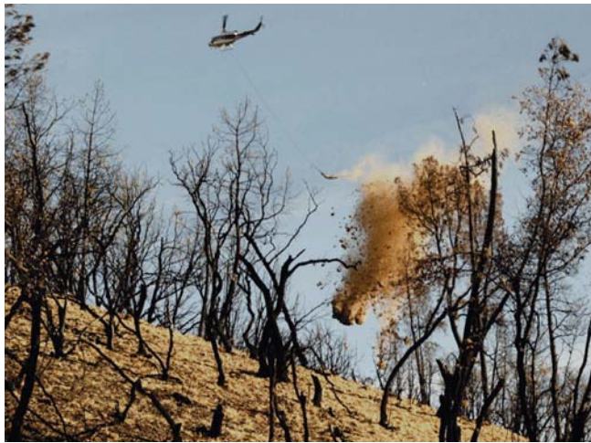
An aerial application of straw mulch treatment is released over the target area by a cargo net suspended below a helicopter.

mulches because of their greater resistance to wind displacement. Both straw and wood mulches can be applied aerially, an important advantage when large, areas in remote areas require treatment.