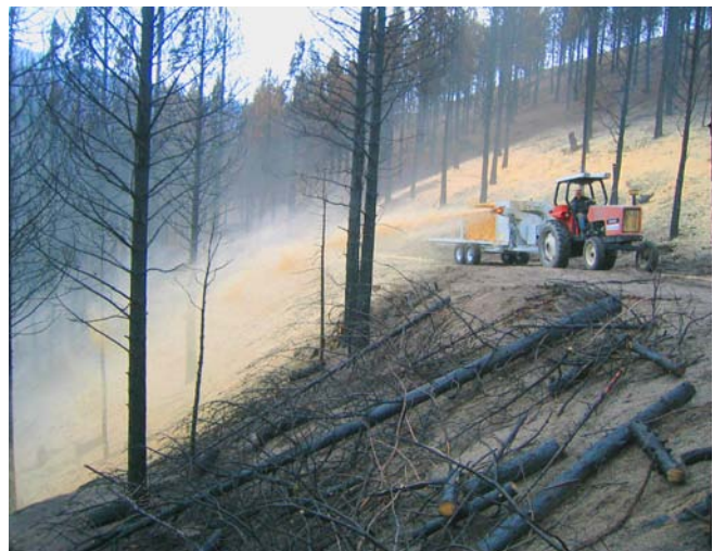
After the 2007 Cascade Complex Fires in Idaho, a trailer-mounted blower pulled by a tractor applies straw mulch as postfire treatment down slope from a road.

Dry mulches—straw, wood strands, and wood shreds generally outperform other treatments in reducing postfire hillslope erosion. They provide immediate ground cover, trap sediment, and have reduced erosion rates by up to 90 percent or more. Wood strand mulches stay in place longer than straw