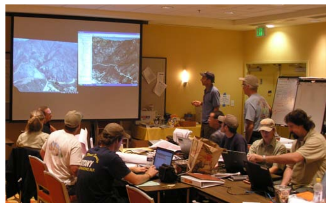
A BAER team assesses potential threat probability of debris flows to infrastructure and possible treatments following the largest fire in Los Angeles County's recorded history.

A large part of fire management cost is postfire treatment, beginning at times even before the fire is completely contained.