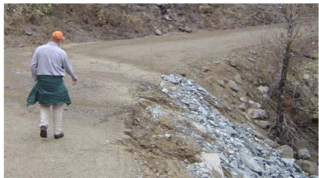
The collection point of a rolling dip with a road fill slope (an area where collected water will drain) and armored with rock after the 2007 Tripod Fire in Washington.