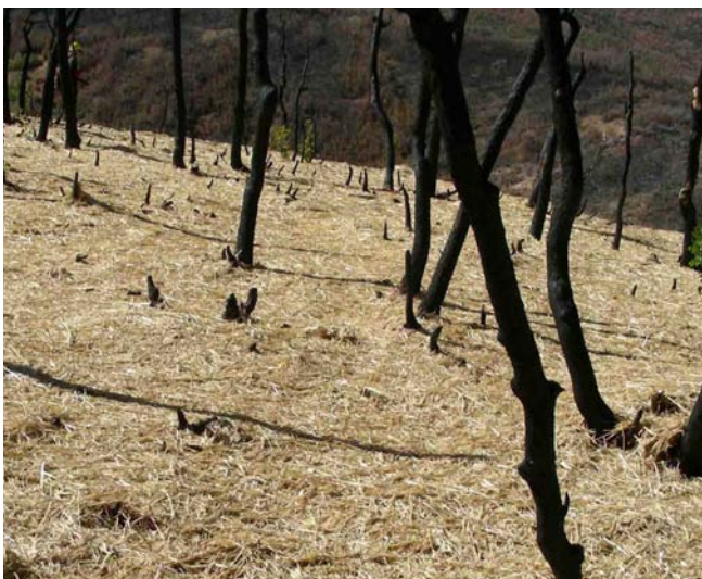
This is an example of a postfire straw mulch application.

On the other hand, assessing the value of public health and safety, resources that are frequently identified in the postfire environment, is problematic. How do you put a market price on public safety or human life? Both USFS and DOI personnel agreed with the JFSP research team that a price should not