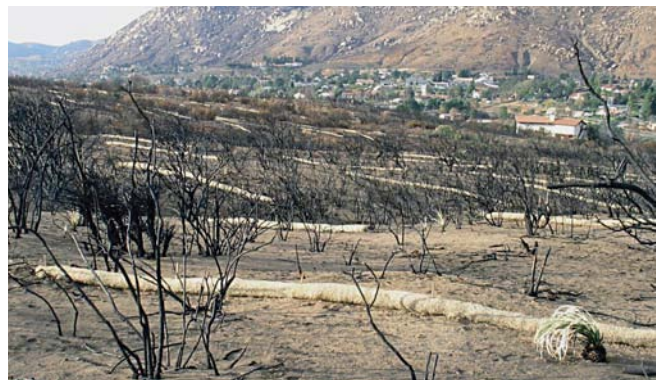
On a burned hillslope in southern California, straw wattles were installed in a staggered layout.

Combinations of treatments can take advantage of a single application process to achieve multiple goals; for example, seed is often mixed into dry or wet mulches. Combination treatments, however, can be costly. In some cases though, the expense of multiple treatments and/or treatment maintenance may be justified if a resource at risk has a very high value. This was the case after the 2002 Missionary Ridge Fire in Colorado, which placed the intake structure of a dam at risk of sedimentation. The reservoir above the dam provides water for the city of Durango. In this case, contour-felled logs, straw mulch, hand seeding, and straw bale check dams and debris racks were all implemented at higher than normal rates. In addition, the hillslope and channel barriers were cleaned out and maintained after individual storms.