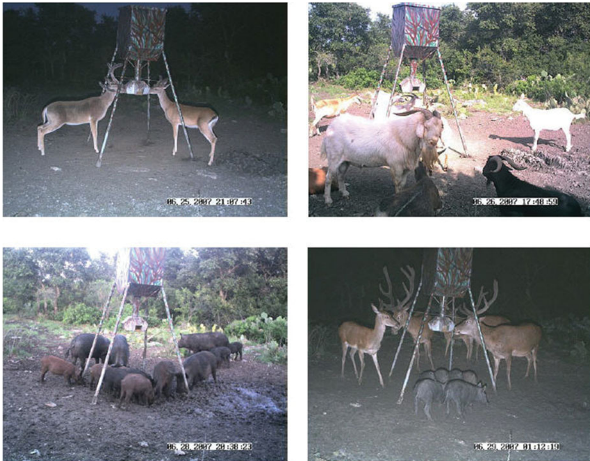
Fig. 2. [colour online]. Examples of livestock and wildlife use of a protein feeder in South Texas.

parts of the South and Midwestern United States [64]. This often controversial industry is thought by some to pose a risk for introducing and establishing additional foci of endemic wildlife diseases, including M. bovis [65]. In some locations, exotic hoofstock or native Cervidae are released or baited into a semi free-ranging environment for recreational hunting. There, the animals often mix with cattle and feral swine (Fig. 2), creating an environment for pathogen exchange [66]. Some livestock producers have boosted incomes by combining exotic and native hoofstock game ranching with traditional cattle production; others have replaced cattle with exotic or native hoofstock ranching as a new form of animal agriculture.