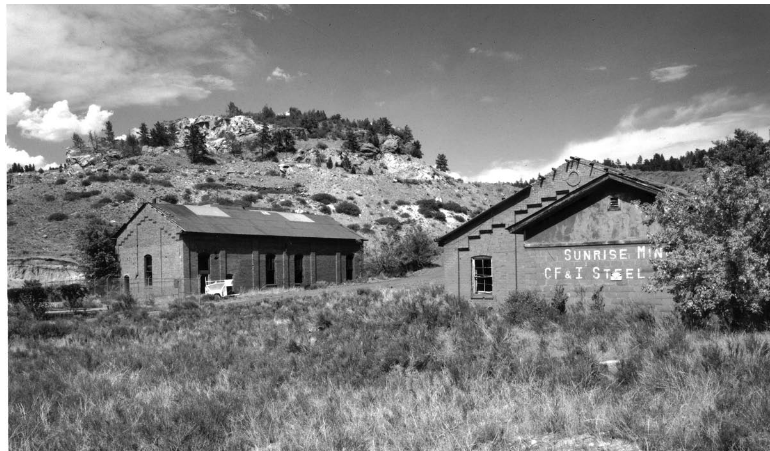
(Above) Casa Aztlan on South Racine Avenue is a visual marker of the multicultural neighborhood that is Pilsen Historic District in Chicago, IL. (Below) The Shower and Changing Room and the Boiler House are just two of many supporting facilities erected for the daily operations of the local iron-ore industry at Sunrise Mine.

The Pilsen Historic District is significant for its associations with Chicago's Bohemian-American and Mexican-American ethnic heritage, social history, industry, and architecture. Listed in the National Register of Historic Places on February 1, 2006, the district is located about 2 1/2 miles southwest of Chicago's downtown, encompassing 4,405 contributing resources and including a wide array of residential and commercial buildings. Roughly bounded by Halsted Street on the east, Cermak Road on the south, Western Avenue on the west, and the railroad viaduct north of West 16th street on the north, the community was created by Czechs in the 1870s, with