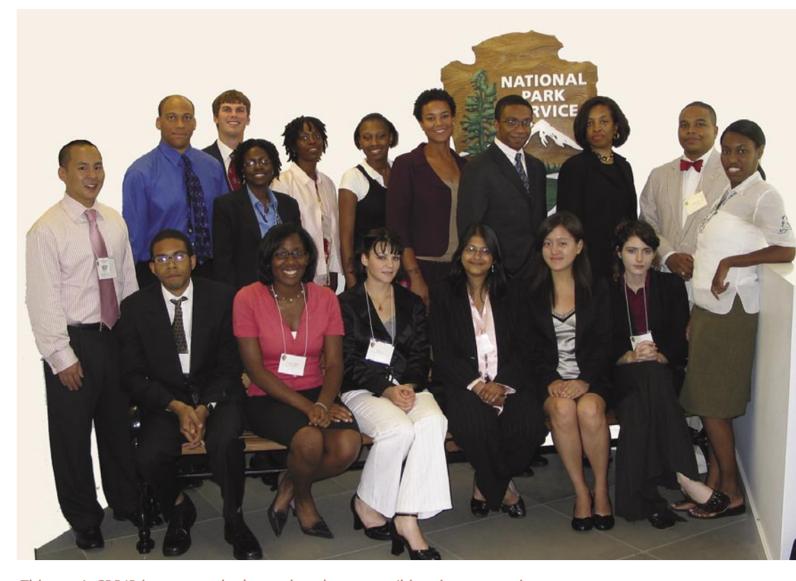
This year's CRDIP interns worked on cultural resources/historic preservation projects in NPS regional offices and national parks, as well as with partner organizations such as the National Parks Conservation Association.