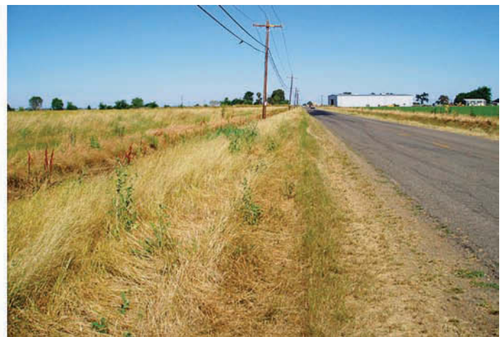
The road edge of heavily traveled site 4 (looking east) is bare (bottom right to center). A dense strip of stunted, invasive annual grasses (Italian ryegrass and foxtail barley) occurs to the left of the road edge on the shoulder (bottom center to center). A strip of the native perennial purple needlegrass occurs on the much-less-disturbed backslope (bottom left to center).