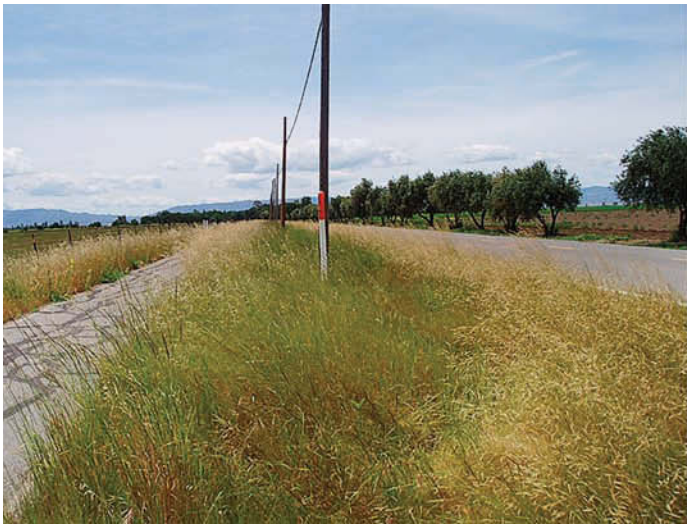
Relatively undisturbed site 9 (looking west) is bordered by a bike path (left) and road (right). Dense strips of the native perennial purple needlegrass (straw-colored inflorescences) are on the backslope (left) and shoulder (right of the phone poles), and a dense strip of the surrounding native perennial creeping wildrye (dark green) is in the swale (surrounding the phone poles).