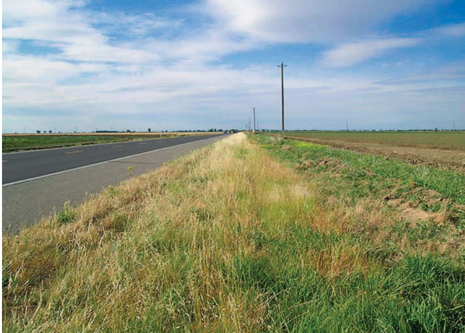
A dense strip of invasive species dominates the road edge (bottom left to center) of site 5 (looking north). The shoulder (bottom center to center) contains the native perennial purple needlegrass intermixed with Italian ryegrass and soft chess, invasive annual species. The swale and backslope (bottom right to center) have been disked (far right). The swale is periodically inundated by irrigation runoff in summer. Heavy disturbance in the swale and backslope has resulted in dominance by the invasives field bindweed, summer mustard ( Hirschfeldia incana ) and wild radish ( Raphanus sativus ).

tween sites was grouped by condition according to topographic zone (table 5). Due to critically low replicates in some groups ( n < 3 ; see table 3), no statistical tests could be run using this data set, but strong trends were evident through comparison of the means.