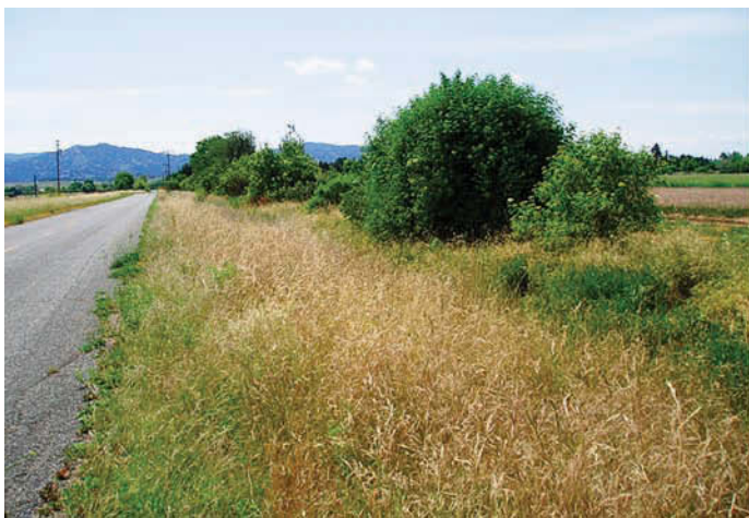
At relatively undisturbed site 1 (looking west), vegetation from the road edge (left) to swale (bottom right to center) is dominated by the native perennial purple needlegrass. The swale is periodically inundated in winter and contains a few individuals of the native perennial meadow barley distributed among a dense cover of common vetch ( Vicia sativa ), an invasive annual.

California annual exotic grasslands are largely composed of the species Italian ryegrass ( Lolium multiflorum Lam.), soft chess ( Bromus hordeaceus L.), ripgut grass ( Bromus diandrus Roth), wild oat ( Avena fatua L.), medusa-head ( Taeniatherum caput-medusae [L.] Nevski) and foxtail barley ( Hordeum murinum L.). Yellow starthistle ( Centaurea solstitialis L.) and broadleaf filaree ( Erodium botrys [Cav.] Bertol.) form a large component of the associated invasive annual broadleaf biomass (Heady et al. 1992; Lulow 2004; Pitcairn et al. 2006). Except for yellow starthistle, all of these invasive species complete their life cycles by the time soils become dry in the summer