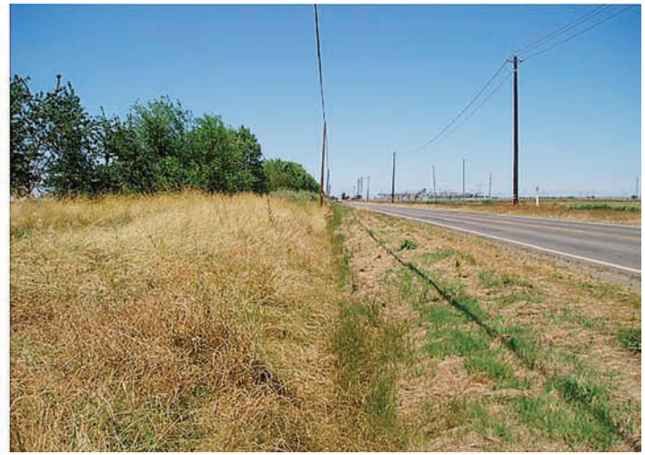
Vegetation cover on the road edge and shoulder (bottom right to center) of site 3 (looking north) is low. Low mowing on the shoulder has resulted in a monoculture stand of Bermuda grass ( Cynodon dactylon ), an invasive perennial. The narrow swale (bottom center to center) is dominated by Italian ryegrass, an invasive annual. Vegetation on the backslope (bottom left to center) is dominated by the native perennial purple needlegrass, with some invasive annual common vetch.

chose to seed native broadleaf species into their native plantings. Those species included yarrow ( Achillea millefolium ), California poppy ( Eschscholzia californica ), gumplant ( Grindelia camporum ) and lupine ( Lupinus sp.), which were seeded at unknown rates.