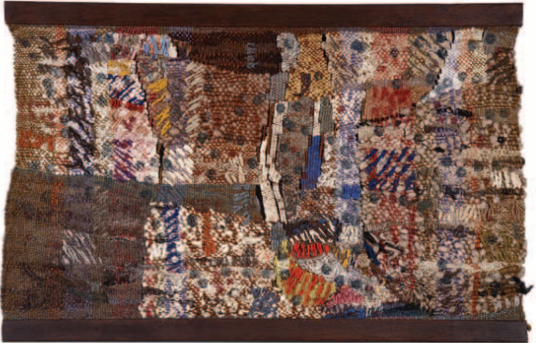
Lillian Elliott, Color it Twill, Tapestry, 20" x 32", 1973 on view at the Tugboat Gallery