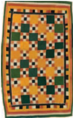
Quilts Ralli, Sindh, Pakistan, c 1974 (far right) Kantha, c 1940-1960, (right)