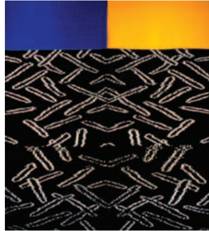
Ancient Text: Indigo and Ochre Mary Zicafoose 2007, weft-face Ikat Tapestry Dptych 58" x 62"

James' wall quilts use digitally printed fabric imagery to evoke the dual physical/metaphysical aspects of reality.