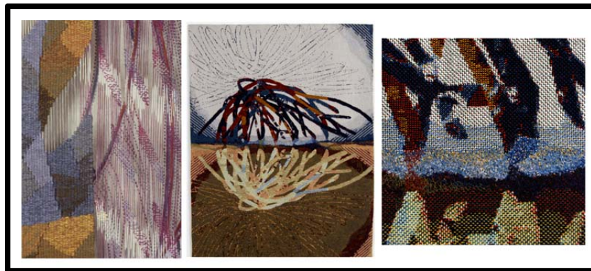
Figure 5. Jennifer Sargent. Left: “Bouree” (detail) handwoven tapestry and painted warp; painted silk background. Right: “Tide Pool” jacquard woven (detail portion shows dense hand stitching applied to the fabric after weaving).

Rautiainen notes that the images in her work are evolving: “I’m slowly replacing images of nature with images of people...and...animals. I’m currently working on a body of work dealing with people in urban landscape.”