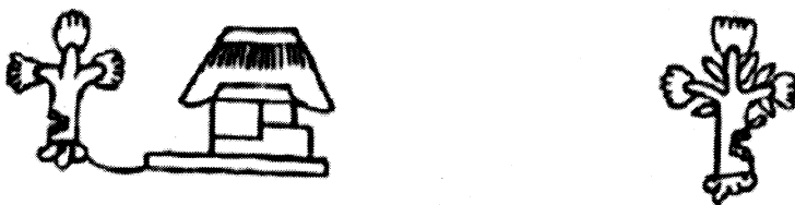
Figure 3: Mexica glyphs representing the city Ahuacatlan and ahuacatl, respectively (Gutierrez and Villanueva 2007:6).

The avocado has been important to indigenous populations in Mesoamerica for food and mythology, as suggested by iconography and European journals, for hundreds of years. It has been documented iconographically all over Mesoamerica. In order to better understand the relationship between indigenous peoples and the avocado, it is important to understand its domestication history and how the avocado and other tropical trees are represented in the archaeological record.