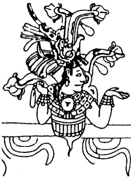
Figure 2: Lady Kanal-Ikal emerging with an avocado tree on the side of Janaab-Pacal's sarcophagus (Martin 2006:162).

The avocado has also appeared in the iconography in the Mexica (Aztec) world, which lies to the North of the Maya area. The Nahuatl word for avocado is ahuacatl , or testicle in English. This was mentioned first in 1519 by Spanish chroniclers (Gutierrez and Villanueva 2007). According to Mexica myth, the avocado fruit gives strength. A fruit's form contributes to its properties: the outer form is a result of inner forces. The avocado is shaped like a testicle, and it can therefore transfer that strength to whoever eats it (Gutierrez and Villanueva 2007). Ahuacatlan, a Mexica city, was named after the avocado ("place where the avocado abounds"), according to its glyph: a tree with a set of teeth plus the glyph for "place" (Galindo-Tovar et al. 2007; Gutierrez and Villanueva 2007) (see Figure 3).